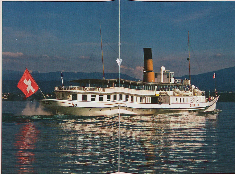
CGN "Simplon" heads across Lac Lemán from Nyón, 24/06/09. An almost perfect Swiss Flag this time.