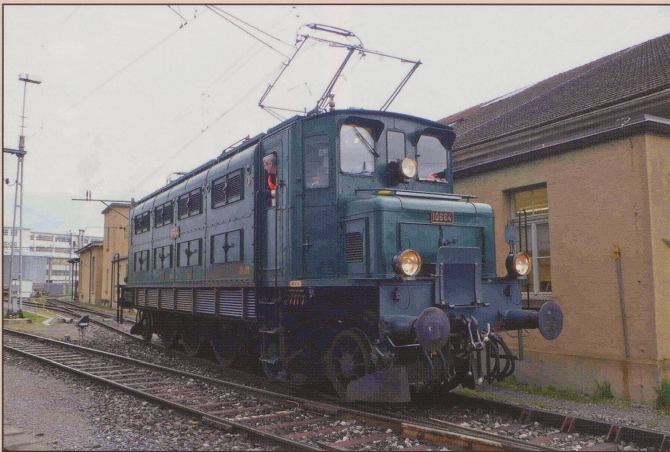
Preserved Ae 3/3 No 10664 has been moved from its normal storage until August 2009 whilst SBB renew the roof and is stored at Wetzikon in the meantime.