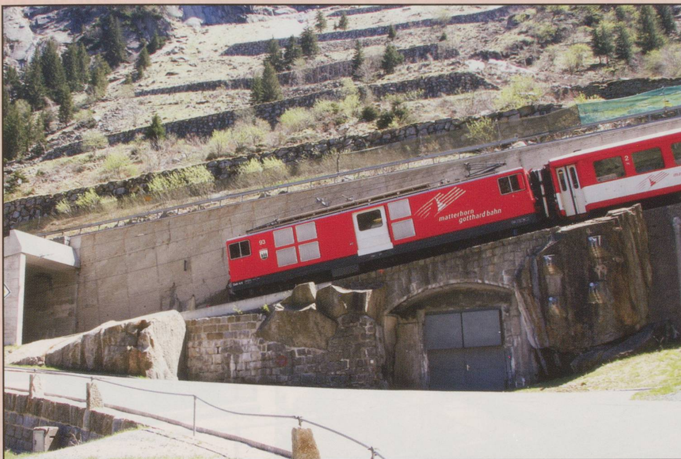
Deh4/4II 93 nearing the Reuss Bridge at Göschenen with the 13.28 from Andermatt.