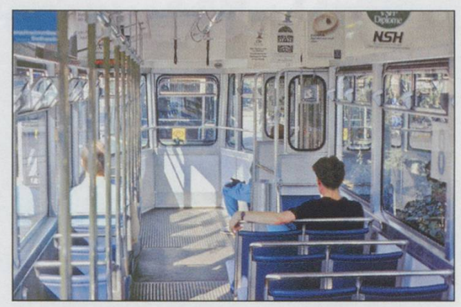
BVB trailer 1446 interior as in 1986.

In 1951 FFA were called upon to provide ten unpowered trailers (321-330) to couple to some of the first batch of power cars resulting in some of the 15 trams running solo. Then SIG/SWS collaborated to simultaneously build another batch of trailers (331-340) to match the 1960/1 power cars so that these could enter service as two car sets.