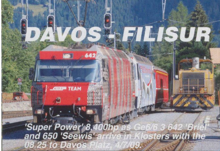
'Super Power' 8,400hp as Ge6/6 3 642 'Briel' and 650 'Seewis' arrive in Klosters with the 08.25 to Davos Platz, 4/7/09.