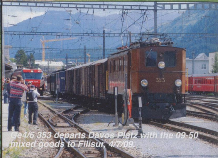
Ge4/6 353 departs Davos Platz with the 09-50 mixed goods to Filisur, 4/7/09.

The Jubilaeumfest to celebrate the 100th anniversary of the RhB's Davos to Filisur occurred over the weekend of June 4th and 5th 2009. Thanks to the STO website I was able to arrange a competitive package in the Davos 'Hotel Sport' that had the advantage of having a free Railover ticket for all journeys between Klosters and Filisur as well as all mountain transport in the Davos/Klosters area.