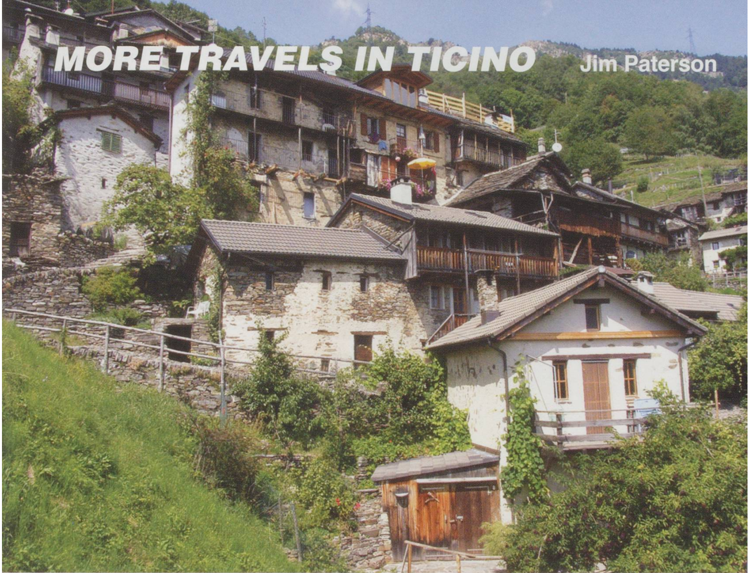
View of Indemini.