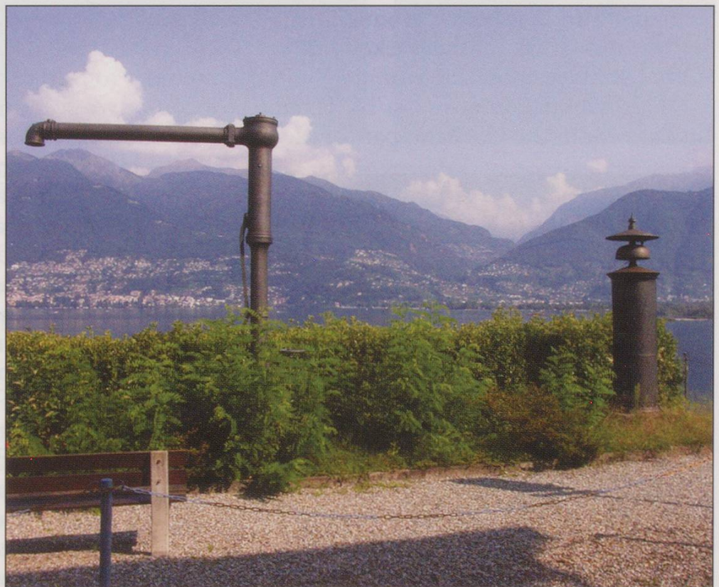
MIDDLE: Setra postbus at Cadenazzo, on the lakeside service from Dirinella to San Antonino. BOTTOM: Heritage railway furniture at Magadino-Vira, with Locarno in the background.