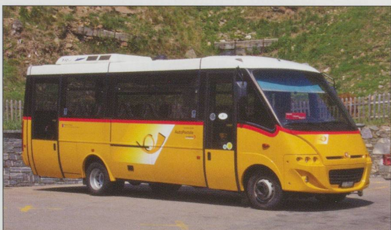
TOP: The post bus on which we travelled from Luino to Ponte Tresa.