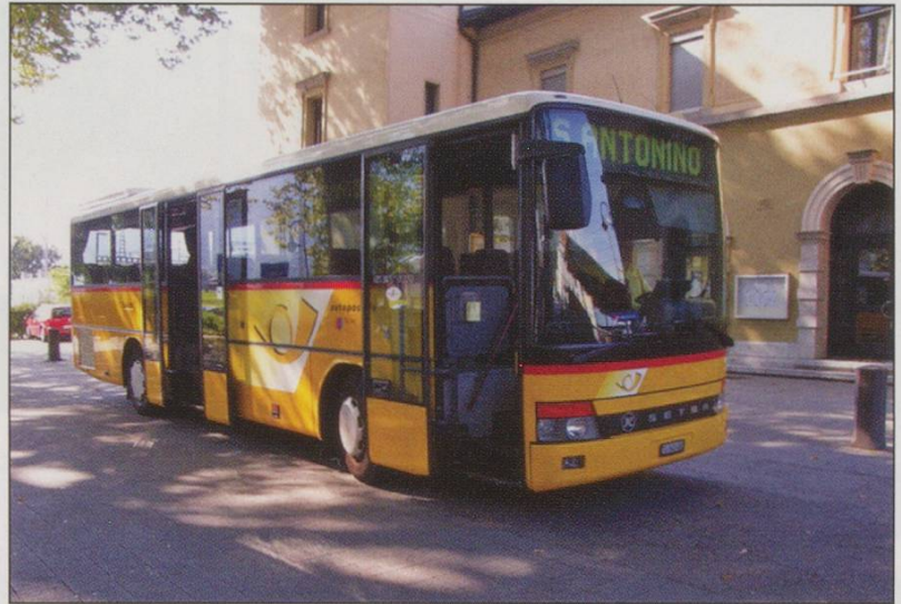
TOP: "Postal vehicles have priority" sign. "Post Horns" on the Iveco.