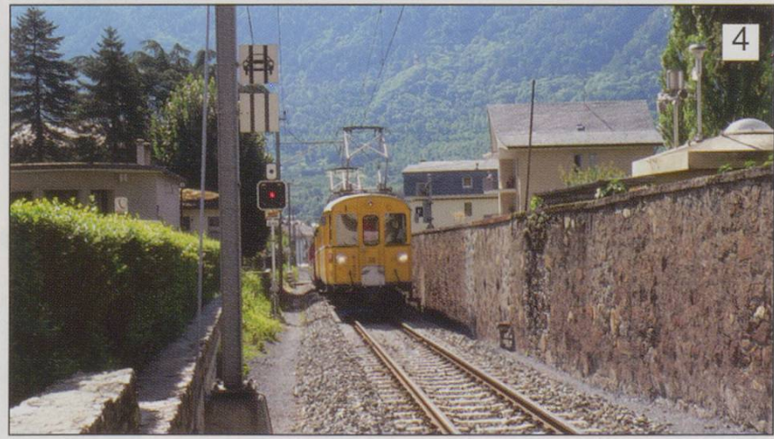
1: Le Prese 2, 3, 4: Tirano