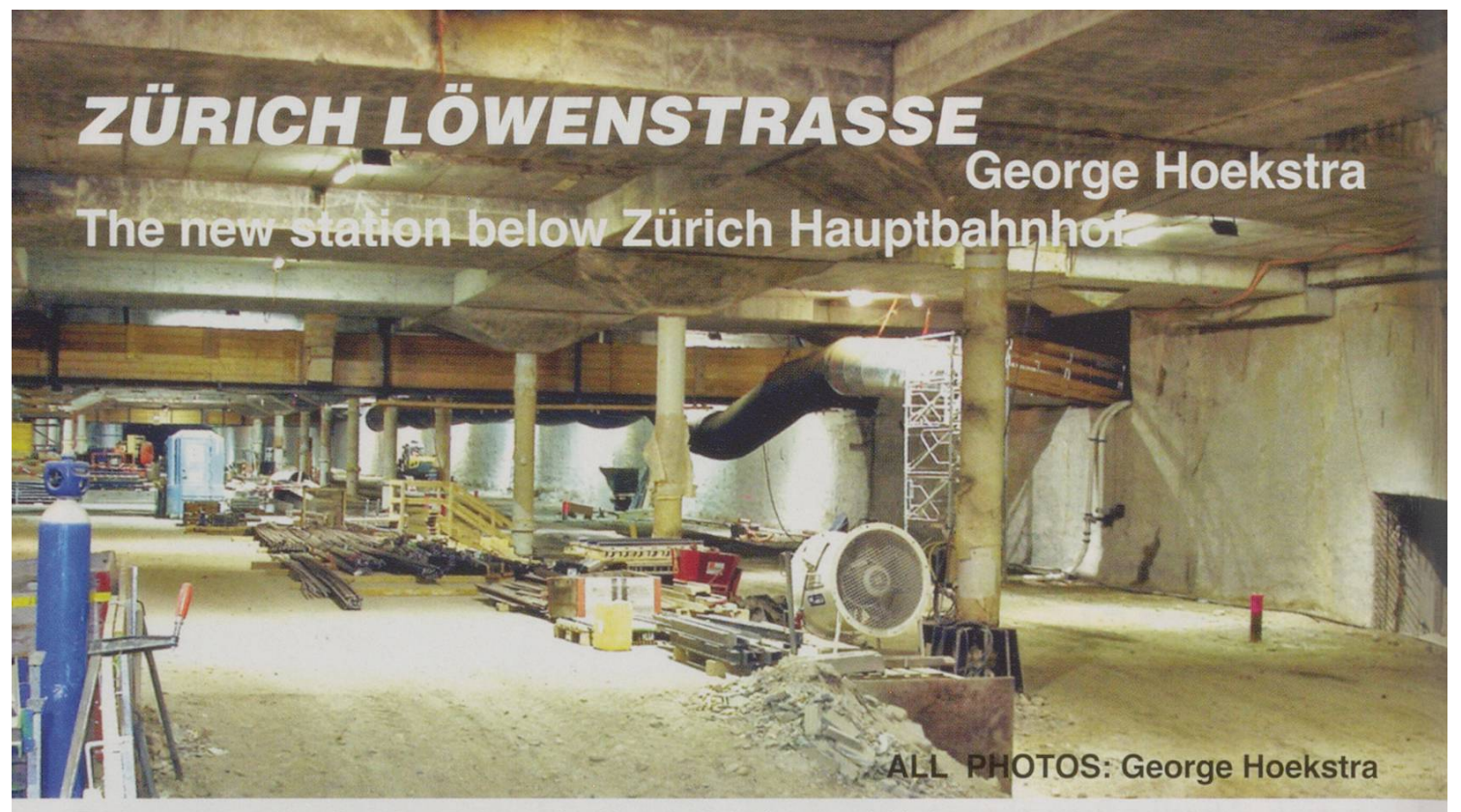
During 2002 – 2004 when the track into the Hauptbahnhof was re-laid, the opportunity was taken to construct part of the new underground station (shown here) in relative ease, before the new track was laid down.

On the third day of a recent symposium organised by SMA + Partner for professionals in the railway industry, delegates had a chance to visit the building site of the new Zürich "Löwenstrasse" through station. This is being built underneath the existing Hauptbahnhof. As I am a civil engineer, this was especially interesting for me. I was even able to add some explanations in English for the mostly foreign participants. The Hauptbahnhof has no more capacity left and traffic is still growing fast. Several possibilities were explored, but planners managed to convince the voters of Zürich, that the only really practical solution (and the most expensive one) was to build an additional through station underneath the existing one. This way the city would not be disfigured and future growth could still be accommodated.