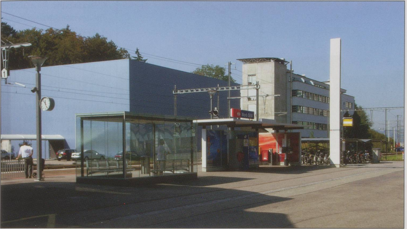
2a. The new facilities at Worb SBB

(Photo 2b). The railway buildings subsequently made redundant can then be released onto the property market for resale, long term lease or conversion to an alternative use, with each option providing an opportunity for additional income. Boards advertising surplus railway properties, whose original function has now disappeared, can be found at many stations (Photo 3) whilst a website ( www.sbb.ch/immobilien ) is also available, showing the complete range of railway properties currently on offer to the public, ranging from freight sheds and loco depots through to stations. In most cases their use has been replaced through the arrival of new technologies, along with more efficient working practices that provide substantial cost savings for the operators.