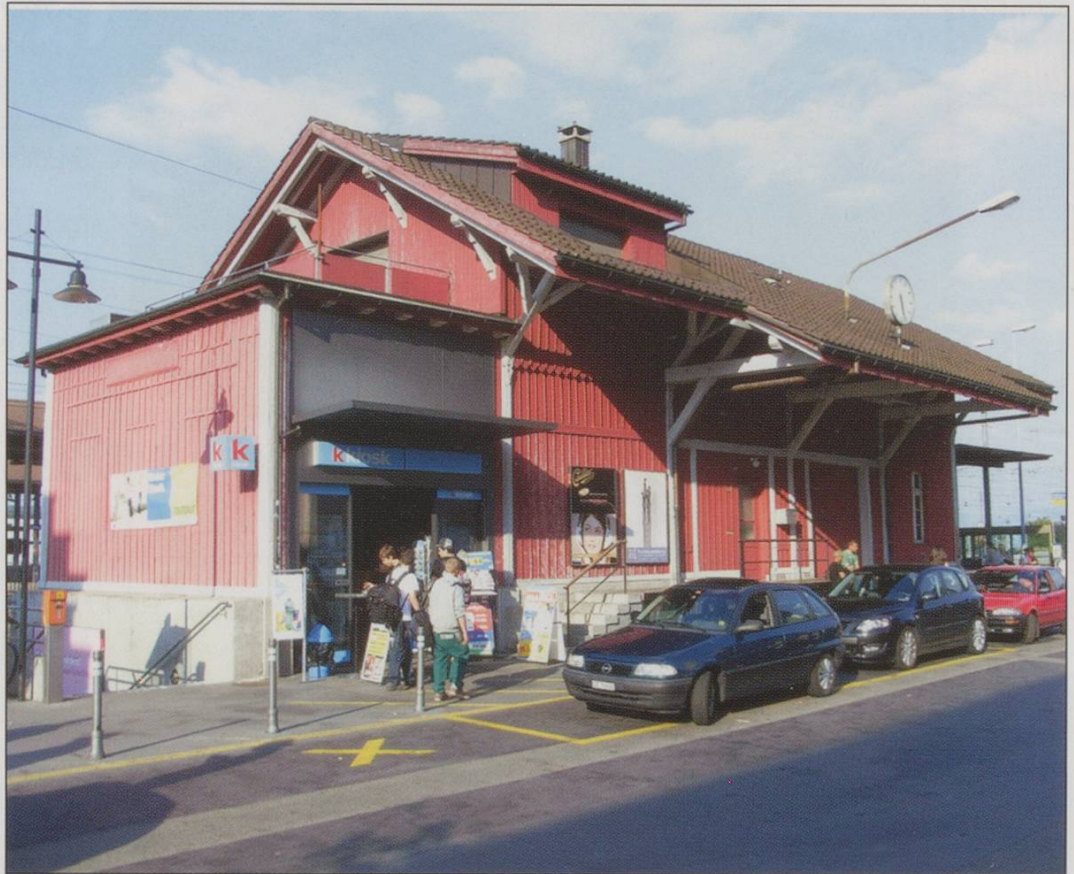
5b. At Pfaffkion a 'Kiosk' outlet now occupies part of the former freight shed, 9/2009.

drainage capability and, although gaining access to and working within this area could be potentially hazardous, this could safely be arranged between train movements given the more relaxed Swiss attitude to H & S issues.