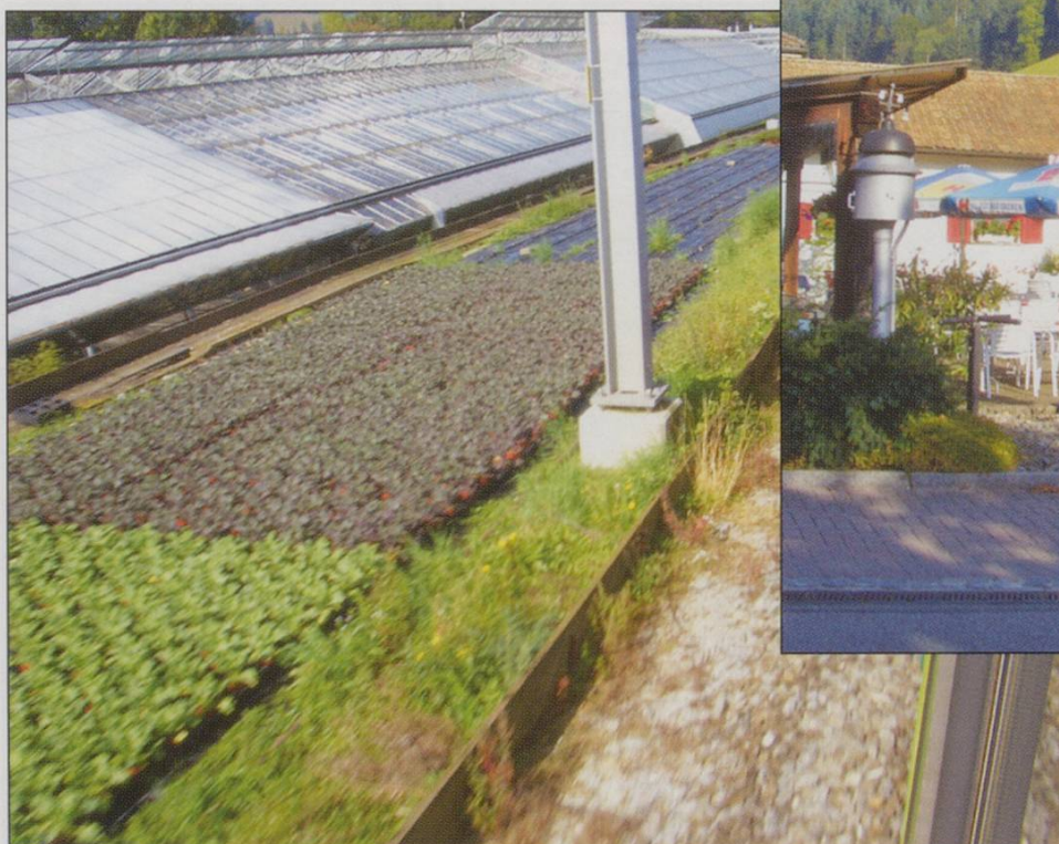
8. Langnau. Part of the re-aligned track formation that is now in use for plants, 9/2007.

railway equipment to be found in places other than on the network or in museums. A hotel garden adjacent to the station in the town of Trubschachen contains a selection of well-preserved railway equipment (Photo 9). The town is also home to the well known 'Kambly' range of biscuits and the factory contains a shop open to the public ( www.kambly.ch ). Finally, should you too