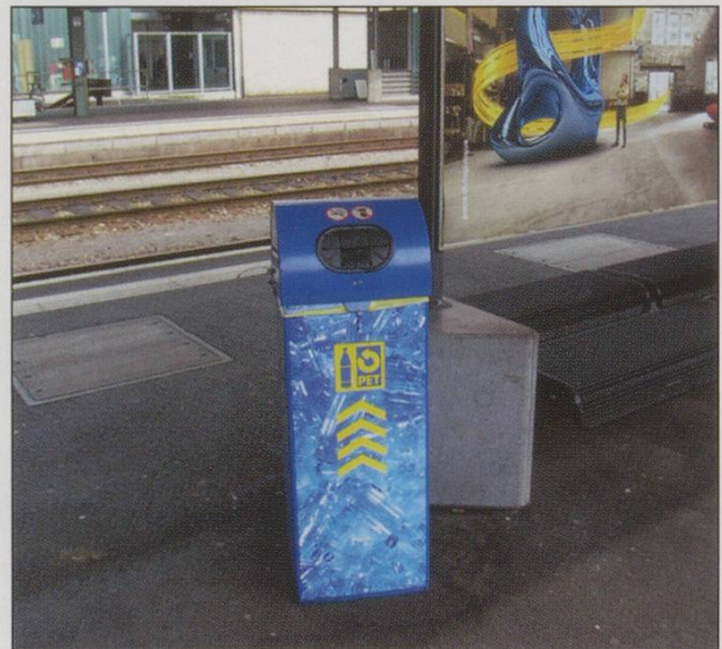
1. Lausanne. PET recycling bins are located at most stations, 9/2009.

decline of freight facilities at local stations. This is something that I touched upon in an earlier article ("Not only trains" – SE 100) and, for example, can already be seen at Worb SBB station, where the traditional staffed station has been replaced by unmanned, cheaper to maintain, facilities. (Photo 2a) Today most travel to and from Worb is via the modern Worb Dorf Station