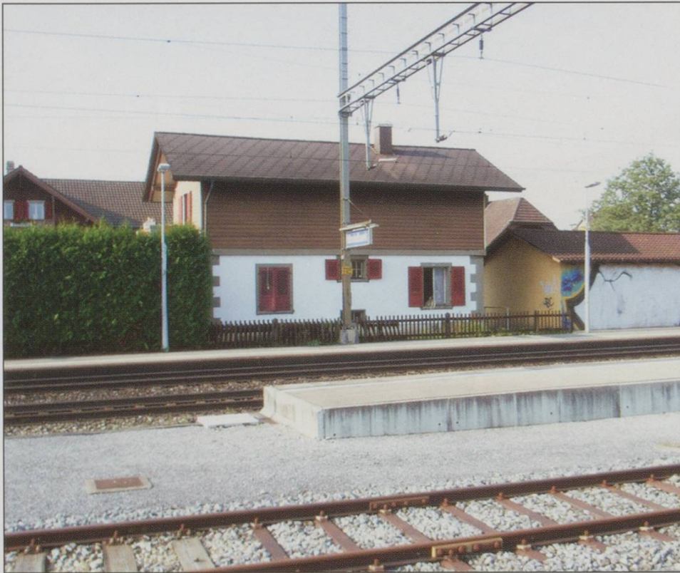
4. Hindelbank. The unmistakable shape of a signal box now converted to a private residence, 9/2008.

‘Avec’, ‘Co-op’, ‘Kiosk’ and ‘Migros’ organisations is an obvious move. The ‘Kiosk’ shop at Pfaffikon, however, differs slightly, being located in the freight shed as opposed to within the main unmanned station (Photo 5b). As some of these enterprises also sell tickets in reality these