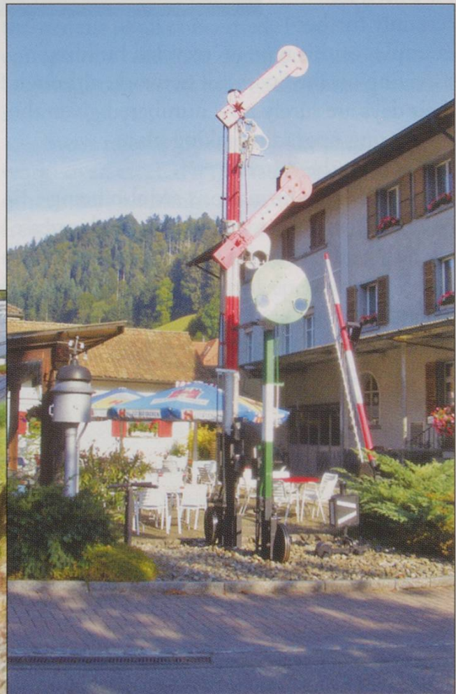
9. A hotel at Trubschachen displays redundant equipment in its garden, 9/2007.