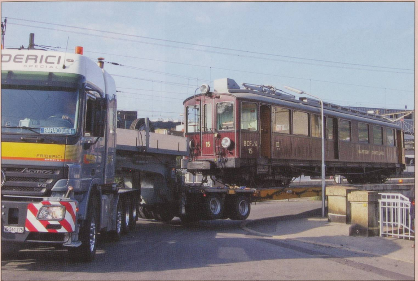
BCFeh 4/4 15 (1909) being unceremoniously returned to Martigny-Chatelard from Blonay-Chamby! Taken in Vevey on 2.10.2009.