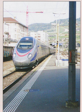
ETR610 on test passing through Vevey station on 2/10/09.