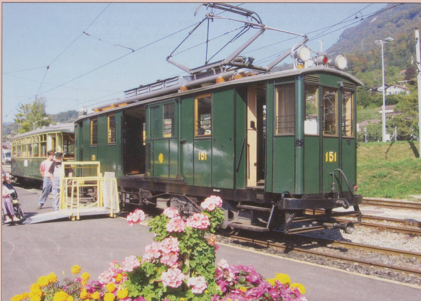
CGTE Fe 4/4 151 (1910) at Blonay on 29/9/09. This tram will be celebrating its centenary this year.