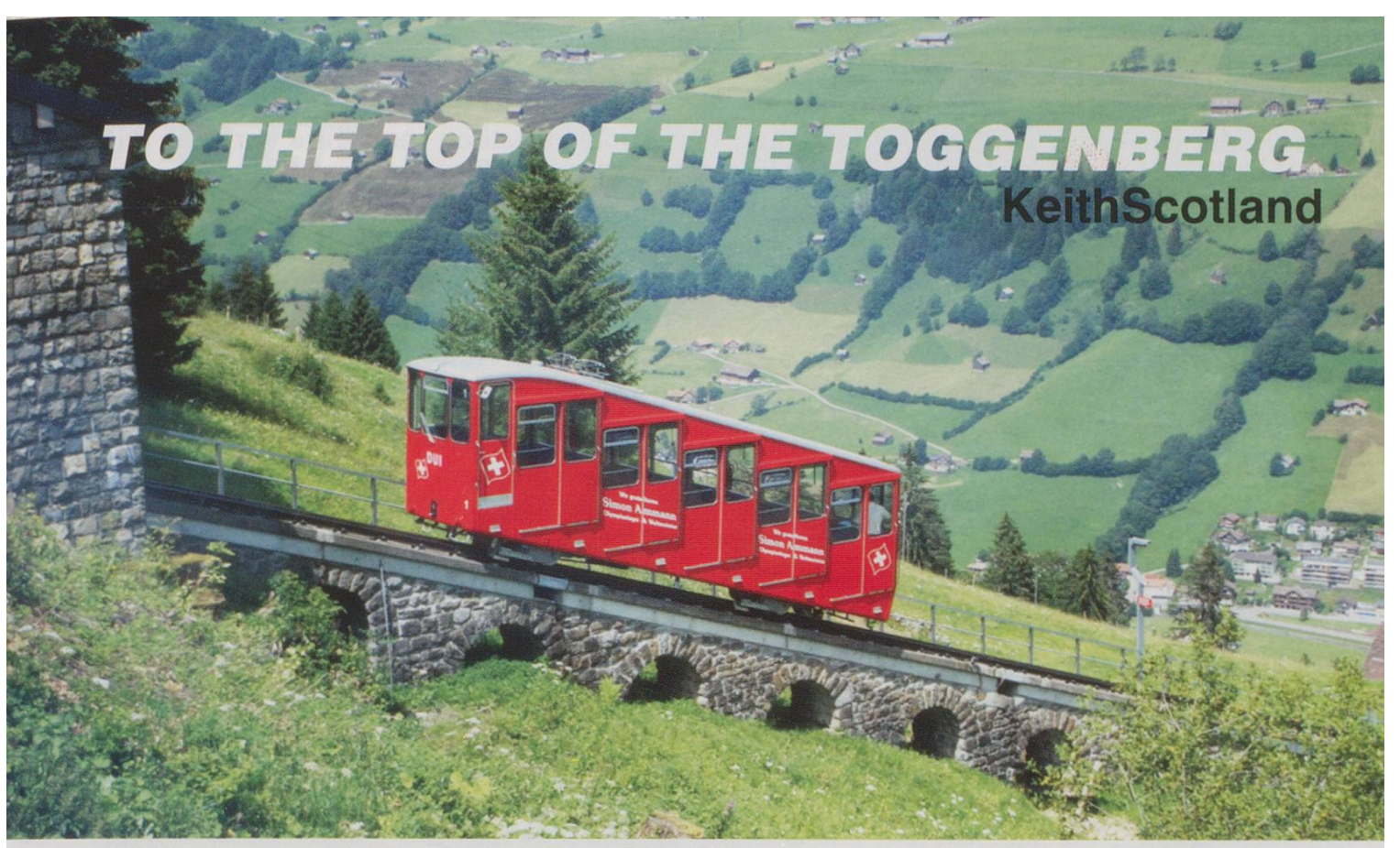
DUI Car 1 approaching the Bergstation on 23/07/2009