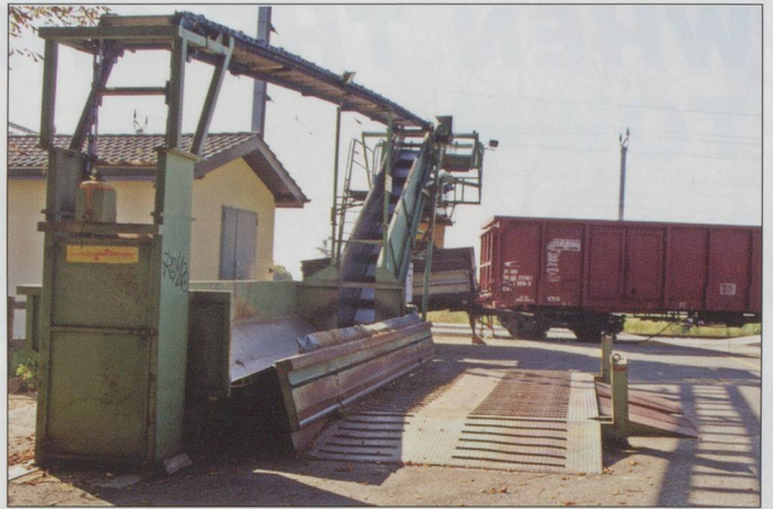
The mechanical sugar beet loader at Apples on the BAM