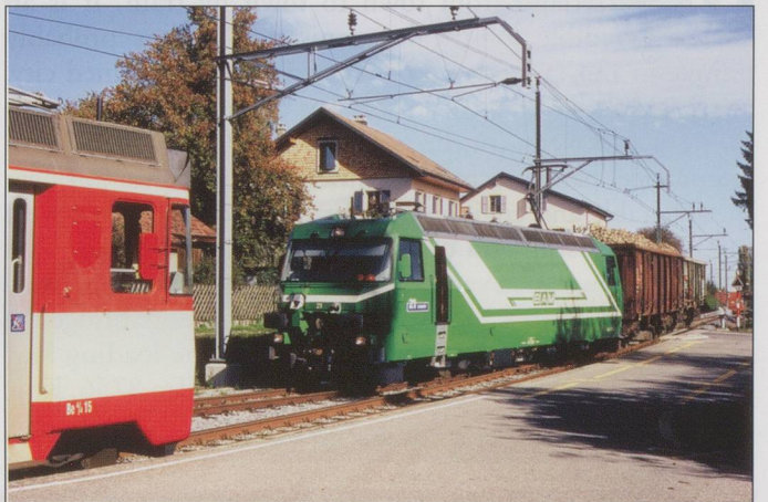
BAM Ge 4/4 No 21 brings some sugar beet into Apples