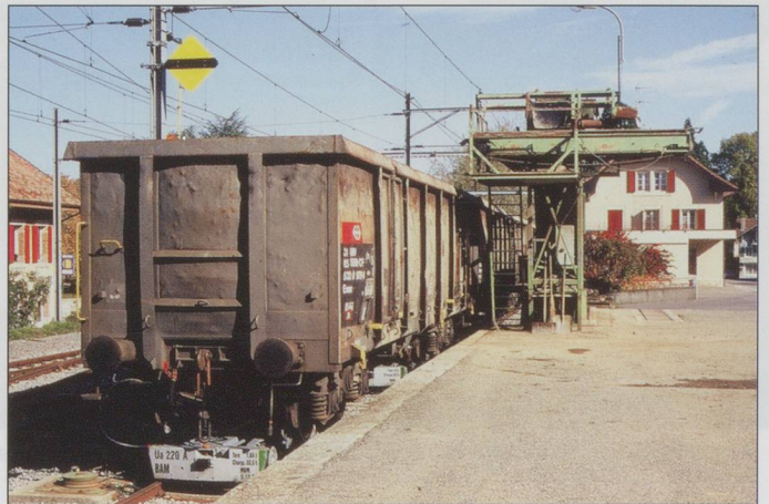
Loading sugar beet at L'Isle on the BAM