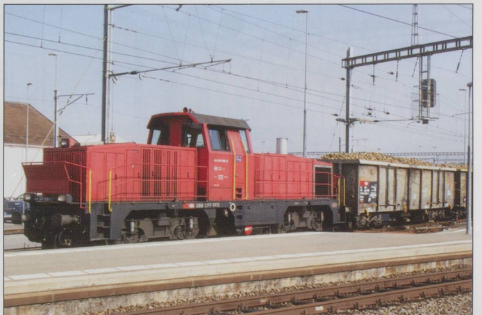
SBB 841 000 at Yverdon on a sugar beet train