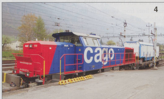
3 & 4: Am 834 077 waiting to reassemble the train along with a selection of flat wagons with various circus equipment on them.