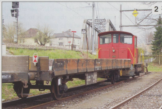
1 & 2: Tm 8756 waiting in the yard to move the flat cars to be loaded-up with the vehicles that had gone to the Circus site.