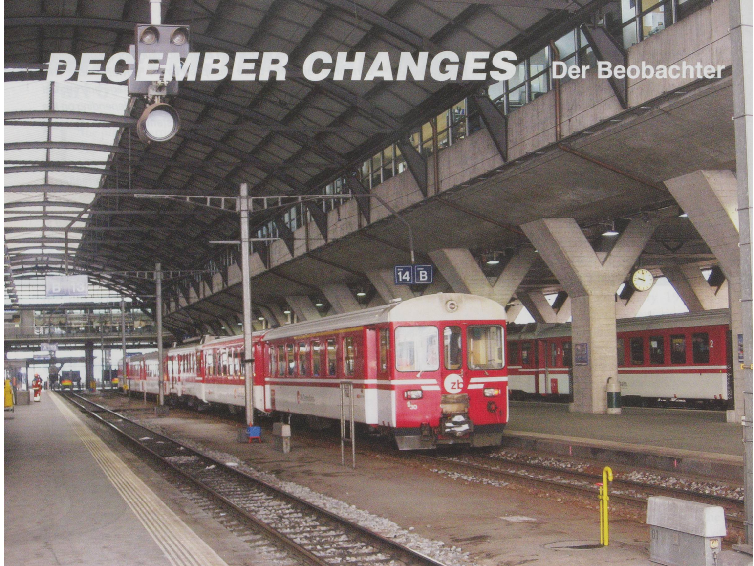
A former LSE Unit awaits departure for Engelberg at Luzern.