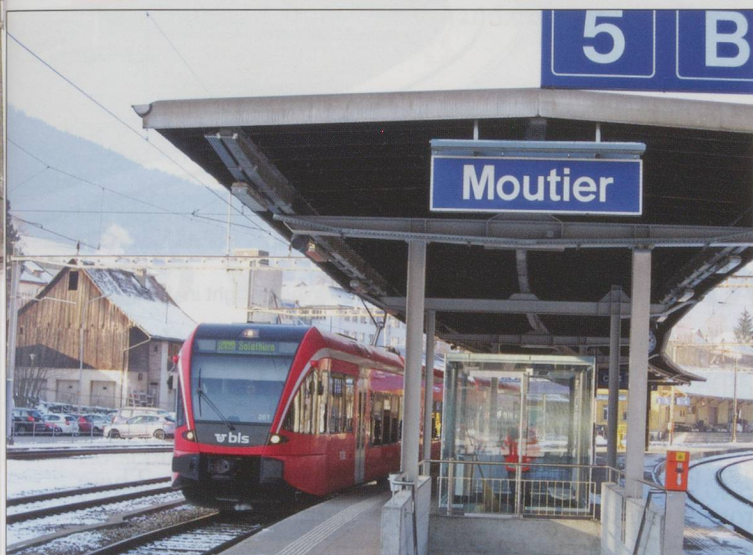
BLS unit at Moutier on a Solothurn service. These GTWs will be transferred to the SBB.

Further to the agreement between BLS and SBB to exchange certain routes, the line from Konolfingen to Luzern, built by the Jura-Bern-Luzern Bahn and long part of the leisurely main line between Bern and Luzern, is now in the tariff and business competence of the BLS. For some time the BLS has operated the regular semi-fast through trains, often with 465 class locomotives. If you are in a hurry, you now take the more roundabout, but faster, route via the high speed line and Zofingen. In return the BLS has ceded Solothurn West – Moutier, the route of the former SMB and part of Regio Mittelland (now BLS) to the SBB. This has the curious effect of again isolating from the parent system the BLS Jura outpost of Moutier – Grenchen Nord (through the Grenchenberg tunnel) built to give the BLS direct connection to France via Delémont and Delle. The SMB line had in recent years been a kind of umbilical, although never more than a very rural branch.