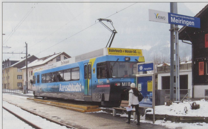
The old MIB terminus at Meiringen. The connection to the ZB station is in the foreground.

claimed 1 minute connection time to ZB trains and PostAutos. The connection time between the ZB and the old MIB terminus 300m distant was always optimistically quoted at 4 minutes, but most people never believed it. You had to know the exact location of the MIB platform, then it was a fast walk in all weathers including crossing a sometimes busy road. The reason was that the MIB was never built as a passenger railway, but as an industrial line to serve the power station in Innertkirchen, and its siding out of Meiringen yard was originally adequate. That was no longer the case; a half-hourly service on the MIB, together with active marketing of