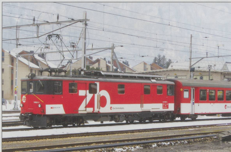
Class 110 001 at Meiringen between Interlaken workings.

In Graubünden, on the RhB Davos – Filisur line, the station at Wiesen, perched between tunnels and the spectacular Wiesen Viaduct, has become a victim of politics. As the Commune of Wiesen has been merged into Davos the station has been renamed Davos-Wiesen matching the others along the valley. That's a warning if you look at the timetable index. It's still there, of course, on Table 915. A good Wanderweg (hiking trail) leads from the station right over the viaduct to Filisur and, at the viaduct end, it passes the last in-situ preserved example of a Hall-type Disc and Crossbar signal, now however no longer in operation.