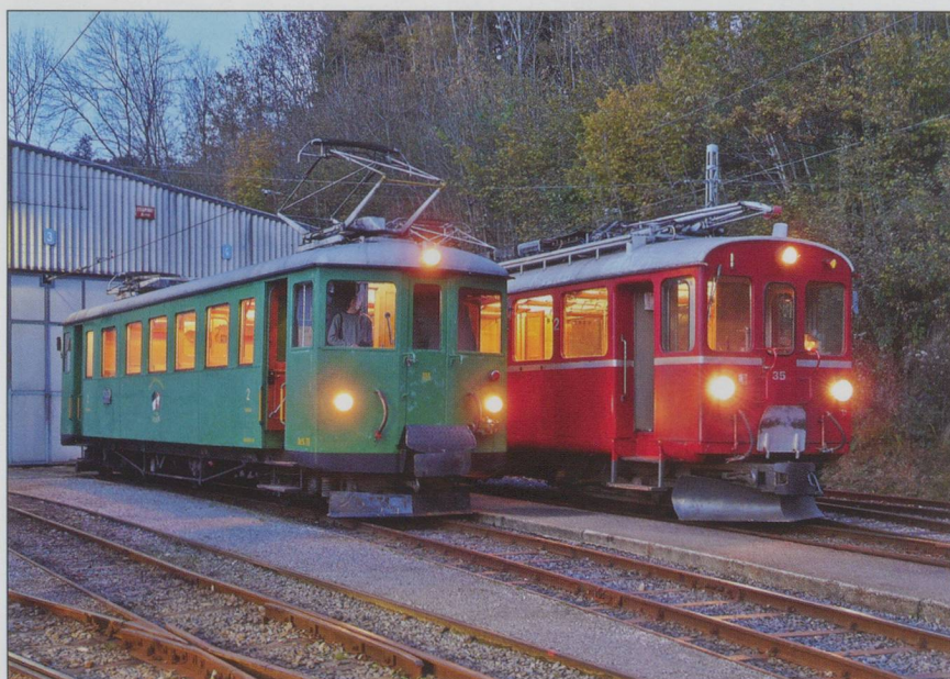
TOP: Blonay Chamby. RhB railcar on the hill.