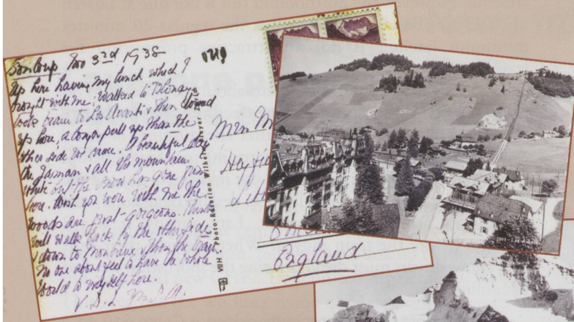
ABOVE: Front and back of postcard from Les Avants. The Sonloup Funicular is the straight line up the hill