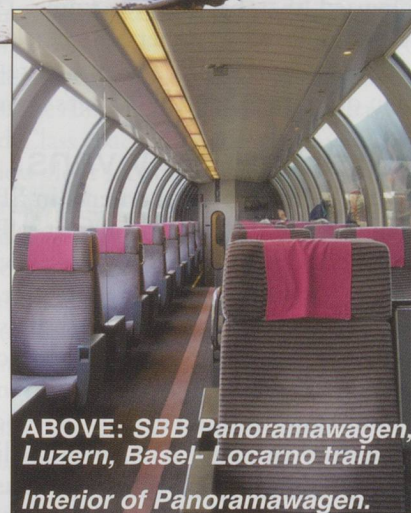
ABOVE: SBB Panoramawagen, Luzern, Basel- Locarno train Interior of Panoramawagen.

soon to be followed by the remaining 11 cars. They have the newest seating, toilets, décor and power connections, and are internationally (RIC) cleared. At present they perambulate hourly across the Gotthard on the slow Inter-Regio trains to Locarno and Lugano, but they are always popular; experienced passengers make for them. The last international use was on the daily Vienna Transalpino, and we thought that after being loaned to cover the various Pendolino crises, they would disappear. We rejoice to be proved wrong.