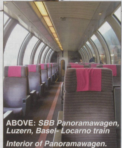
ABOVE: SBB Panoramawagen, Luzern, Basel- Locarno train Interior of Panoramawagen.

soon to be followed by the remaining 11 cars. They have the newest seating, toilets, décor and power connections, and are internationally (RIC) cleared. At present they perambulate hourly across the Gotthard on the slow Inter-Regio trains to Locarno and Lugano, but they are always popular; experienced passengers make for them. The last international use was on the daily Vienna Transalpino, and we thought that after being loaned to cover the various Pendolino crises, they would disappear. We rejoice to be proved wrong.