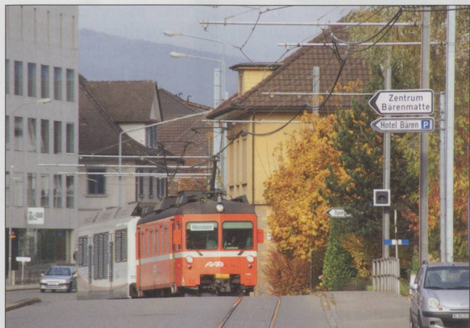
WSB line Aarau to Menziken, on the 3 km street running section just before this was replaced on 20/11/2010.

Another 3 km of street running disappeared on November 20th. Following the closure of the SBB (former Nationalbahn) connection from Aarau to Suhr the WSB metre gauge trains were diverted from the 'Tramstrasse' in Aarau on that date to run on new tracks laid on the old SBB/Nationalbahn alignment, connecting up in Suhr through a new underpass with the WSB line to Menziken from the 22nd. The flat crossing in Suhr of metre gauge WSB and standard gauge SBB tracks, and elaborate catenary switchgear, will disappear. WSB will take over Suhr station.