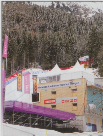
TOP: Crowd on Girmschbiel below Wengernalp Station, Jan 2011.