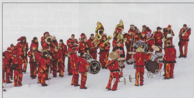
TOP: The famous Hundschopf where the racers take off, Jan 2011. MIDDLE: Girmschbiel tented village, Jan 2011. BOTTOM: A Guggenband entertaining the crowd, Jan 2005.

(carnival bands) dressed in garish uniforms and playing raucous music whilst the appearance of a Swiss skier prompts the crowd to cheering, ringing cow bells and flag waving. It all adds to the atmosphere, as does a commentary, sometimes in English, and the large screens showing the television coverage. The race starts at 12:30 with a few former Swiss Ski racers acting as "course