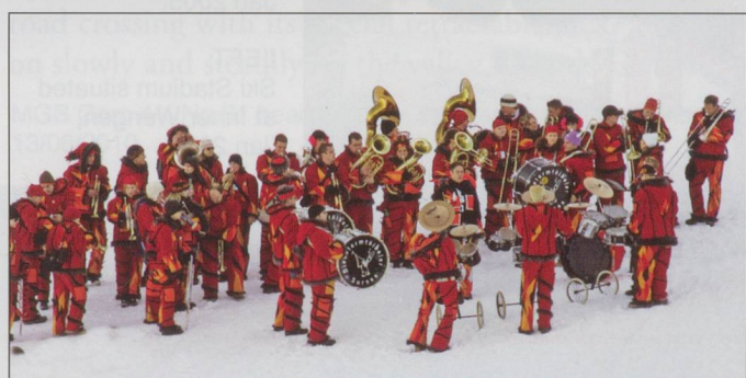
TOP: The famous Hundschopf where the racers take off, Jan 2011. MIDDLE: Girmschbiel tented village, Jan 2011. BOTTOM: A Guggenband entertaining the crowd, Jan 2005.

(carnival bands) dressed in garish uniforms and playing raucous music whilst the appearance of a Swiss skier prompts the crowd to cheering, ringing cow bells and flag waving. It all adds to the atmosphere, as does a commentary, sometimes in English, and the large screens showing the television coverage. The race starts at 12:30 with a few former Swiss Ski racers acting as "course