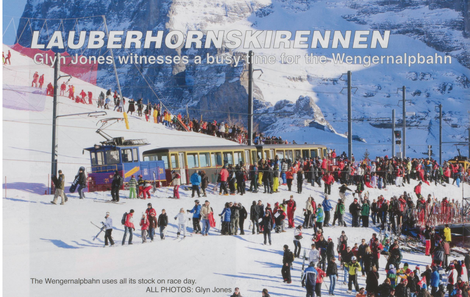
The Wengernalpbahn uses all its stock on race day.

Glyn Jones witnesses a busy time for the Wengernalpbahn