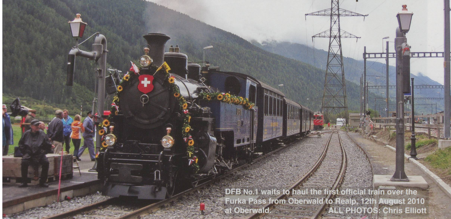
DFB No.1 waits to haul the first official train over the Furka Pass from Oberwald to Realp, 12th August 2010 at Oberwald.