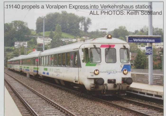
11140 propels a Voralpen Express into Verkehrshaus station.