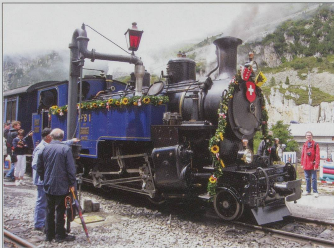
TOP: DFB Nos.6 and 7 cross at Gletsch 13/08/ 2010 as part of the celebrations to mark the opening of the complete Furka Pass line from Oberwald to Realp.

Oberwald I boarded just after 15.00 which was just as well as there was quite a squash inside our coach. Despite the difficulty in booking a ticket many weeks in advance it seemed that they were also being sold on the day and some complimentary tickets were being given out as well! However the ride down was fabulous; first along the road; then into the spiral tunnel; then along the other side of the valley to a footpath which many people were using as a viewing area. All too soon it seemed we were down in Oberwald. Once there we saw MGB Gem4/4 leave Oberwald for Gletsch in order to haul the evening trains. I wonder when it will be used on these rails again.