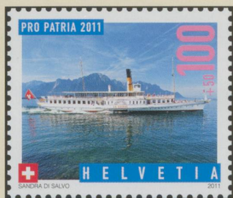
Stamp illustrations, Copyright Die Post.