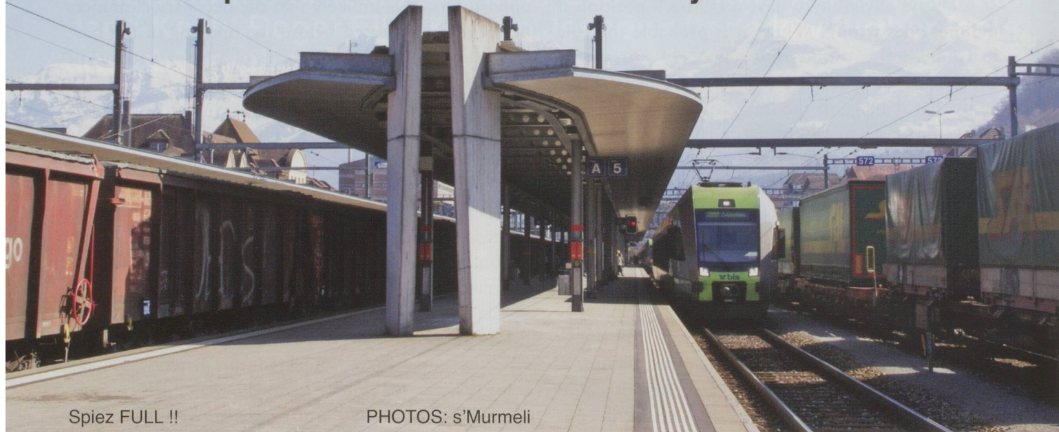
Spiez FULL !!