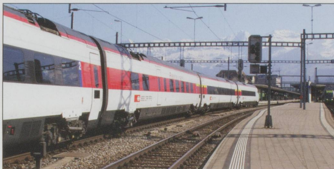
ABOVE: SBB 610 001 "Pendolino" for Milano.