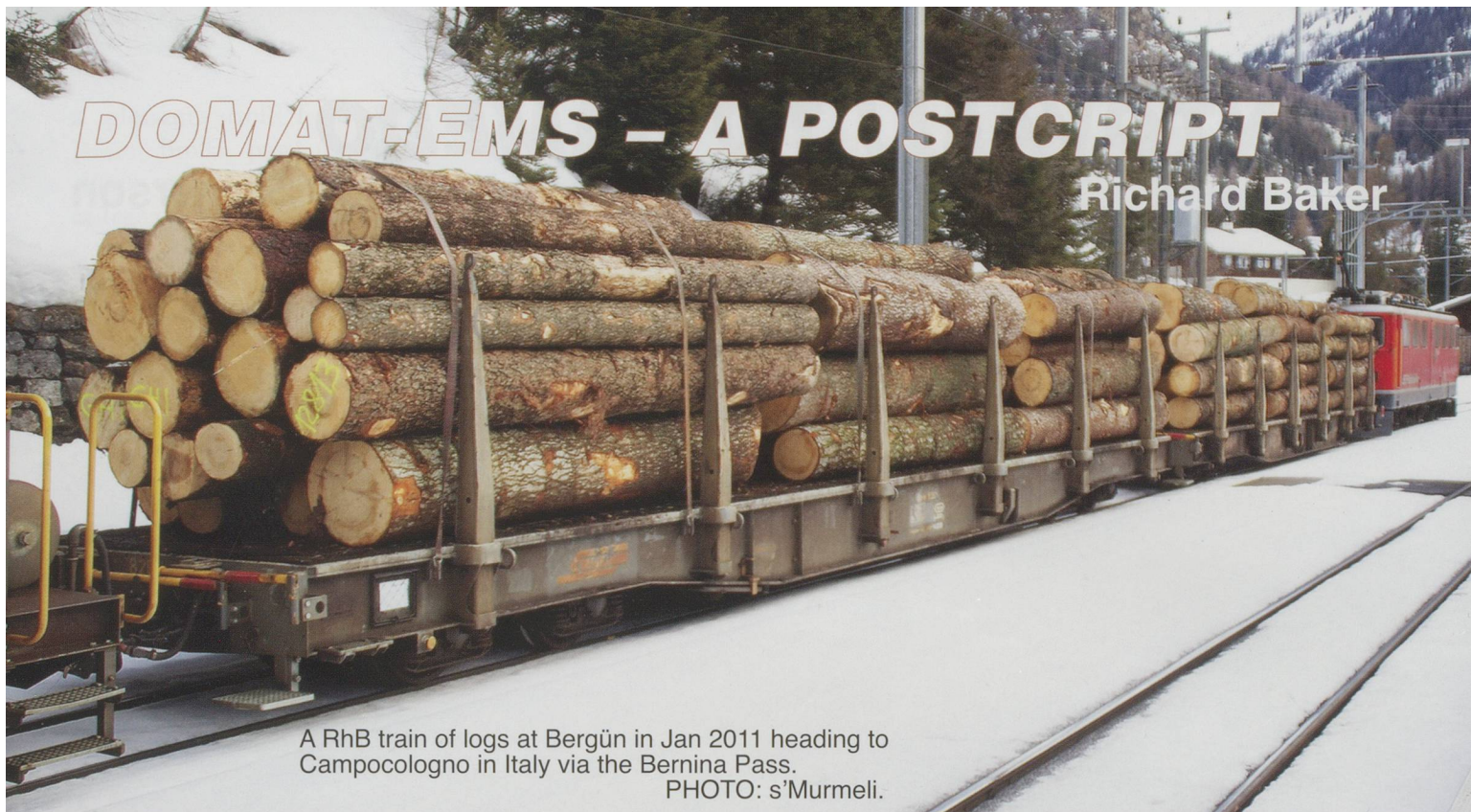
A RhB train of logs at Bergün in Jan 2011 heading to Campocologno in Italy via the Bernina Pass.