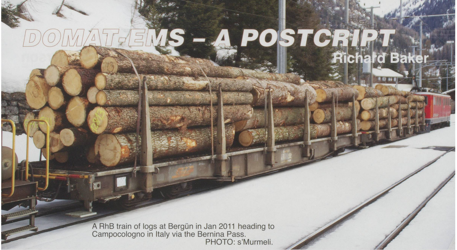
A RhB train of logs at Bergün in Jan 2011 heading to Campocologno in Italy via the Bernina Pass.

In the March 2011 edition of Swiss Express I was concerned to read that the extensive rail-served timber processing plant at Domat-Ems outside Chur had ceased to operate due to bankruptcy. I had first become aware of this operation in 2008, both from seeing it from an RhB train en-route to Filisur, and then reading a magazine article about the investment made by the Swiss subsidiary of the Austrian Stallinger Group. With an expected throughput of some 600,000 cubic metres of wood per year, this was predicted to be a great opportunity locally for both the RhB and the SBB. Not only had there been CHF15m spent on a dual-gauge rail connection to the adjacent lines, but Canton Graubünden had pumped substantial public funds into the development. It was also agreed between SBB/RhB that the former would allocate an Am 843 diesel loco to work the incoming loads of timber “in-the-round” and the outgoing products. Additionally the RhB had apparently ordered ten new wagons (Sgp 7601 – 7610) which, with their double vertical supports, would be very suitable to handle the incoming timber. However, even shortly after the opening of the plant, it was being reported that levels of wood movements were not as great as had been expected, perhaps being affected by the import of cheaper raw material from places like Germany.