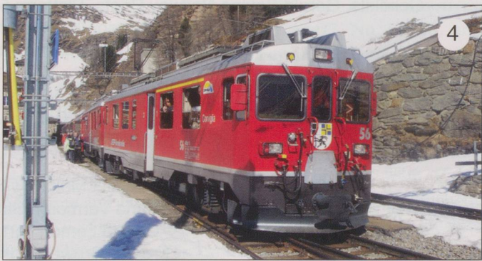
1. Ge4/4 I 605 in the new platform at Bergün with the Schlittellzug in December 2010.