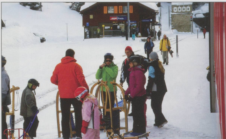
Having taken the train to Preda, the sledging enthusiasts of all ages prepare to slide back to Bergün

If you have a chance, visit Bergün in winter and ride the sledge run. It's quite (well, fairly) safe. But best of all is to take the camera, be at the back of the crowd, and stop on the way down to wait for trains on the famous viaducts. Visiting the RhB never tires. I have ridden over most of it on the footplate and there are still steam trains with 2-8-0s Nos 107 and 108. There is the feeling of a real railway, with 12-car expresses;