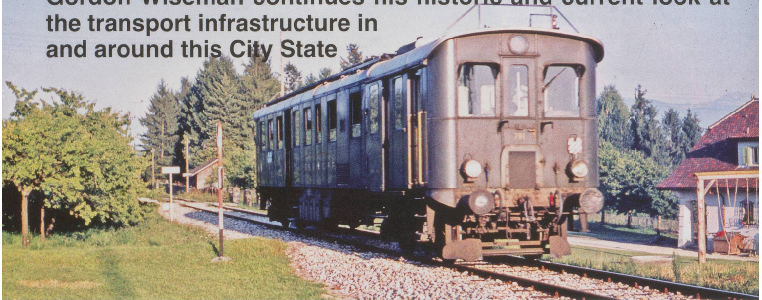
CFF (SBB) BFm 2/4 No.791 heading towards Divonne from Nyon, passes Eysins in August 1958. This unit was renumbered BFm 2/4 No.1691 the following year.