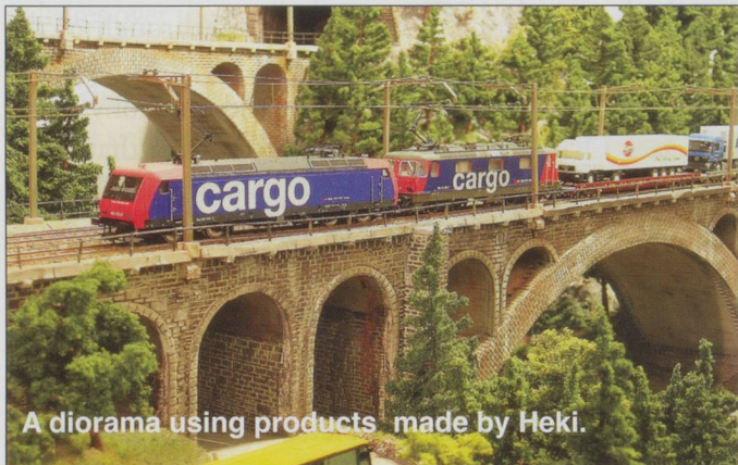
A diorama using products made by Heki.

T here are many good things happening in the railway modelling hobby right now. It is a very good time to start modelling Swiss railways in a number of scales and gauges. This article lists just a few of them.