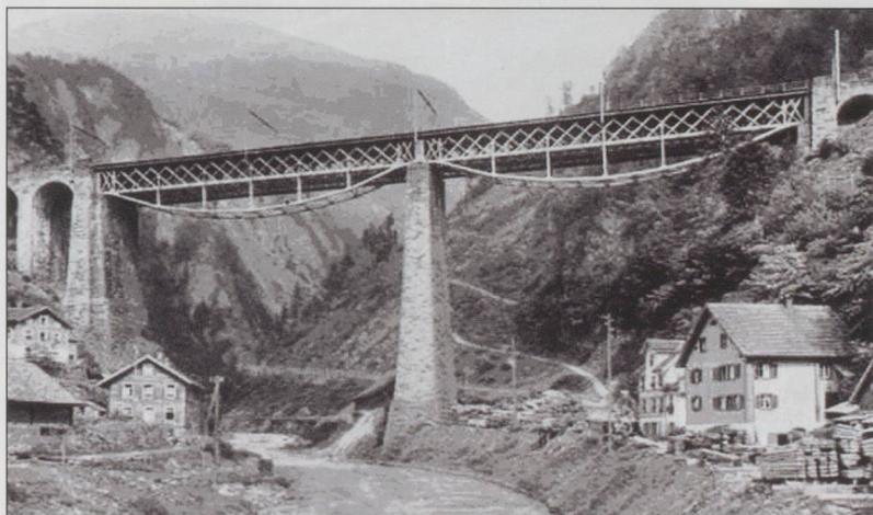
The Kerstelenbach Bridge after electrification.

My interest in Swiss Railways is focused on the Gotthard rolling stock from about the 1920's to the era of the Re 6/6 - a time when Swiss locomotives were green and had round headlights. Unfortunately I have no model railway to run these trains, mainly due to suffering from 'imagination construction' (it is at least easy to make changes) and my own expectation of the end result. The grand plan has always included a bridge as the focal point, which the Gotthard has in abundance, and I chose the Kerstelenbach Bridge on the north ramp at Amsteg. Completed by the Gotthard Railway in 1881 its final form, prior to being replaced in 1969, captured my imagination - the character of old world iron lattice construction has an individuality that some single span stone arches and welded steel beams lack.