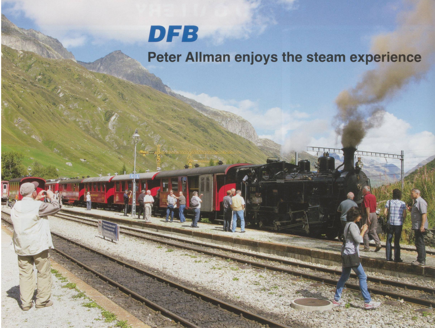
Furker Oberalp HG 3/4 No.4 at Realp ready to take the afternoon train to Oberwald. All photos: PeterAllman taken on 9/9/2011

A trip on the Glacier Express in 2010 was a truly wonderful experience, although afterwards there was a feeling that it was not complete. In pictures of early trains I noticed how the destination plates on the coaches included the name Gletsch, plus the fact that the highest point on the old FO line is 2163m, higher than the current Glacier Express goes. I felt I had been robbed of an important section by the Furka Base Tunnel. However, hearing that the final leg of the DFB from Gletsch to Oberwald had been opened, I knew I could complete my quest so last summer, during our walking holiday in the Goms, my Swiss friend Eliane and I took a day out to ride on the DFB from Realp to Oberwald.