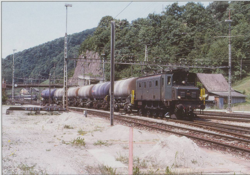
Ae 3/6' 10646 on a freight train between Hätzingen and Betschwanden on October 10, 1983.

Glarus; Schwanden, and Linthal Braunwaldbahn.