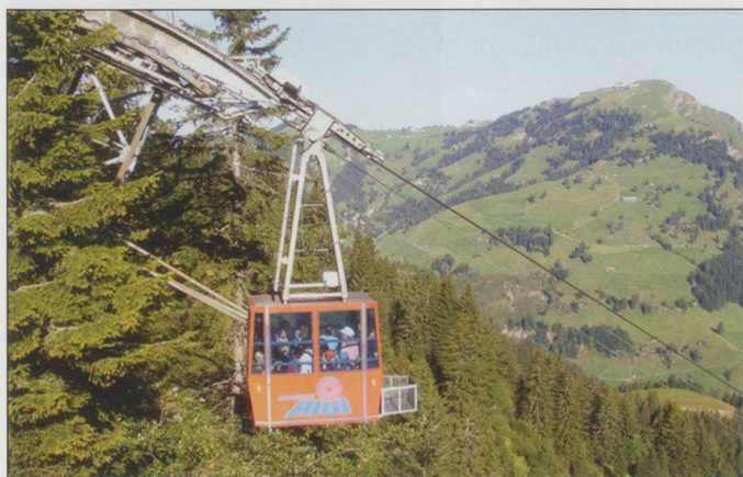
A cabin descends from Rigi-Scheidegg to Kräble.

In May the Rigibahnen (RB) and Rigi Scheidegg AG (RSAG) announced that they are talking about the potential for the RB to add the RSAG's Kräble-Rigi Scheidegg cable car to the railway operator's portfolio of transport on the 'Queen of Mountains'. The 1745m line that rises 880m from the Kräble station of the former Arth-Rigi Bahn was opened in 1953. Its two 15-passenger cars date from 1983 and new investment is needed to upgrade these and other parts of the operation. The two organisations already work in close co-operation but they consider that the way forward to develop the tourist potential of the Rigi; to secure future funding for improvements, and for operational efficiencies, is for the creation of a more comprehensive business unit. The plan is for the RB/RSAG merger to take effect from 2013. The cable car is the transport link that enables tourists to complete the circuit of the upper slopes of the Rigi by riding the train from Arth Goldau, via Kräble, to Rigi Staffel, then back to Rigi Kaltbad from where they can then walk along the 6.6km former track bed of the RSB (Rigi Scheidegg Bahn) to the top station of the RSAG to return down to Kräble. Currently the RSAG is outwith the useful Rigi Day Card (and the Swiss Pass) so it is hoped that joining up with the RB will bring this operation within their ambit. The 1931 demise of the metre-gauge RSB was one of the earliest line closures in Switzerland. RB already operates the Weggis-Rigi Kaltbad cable car.