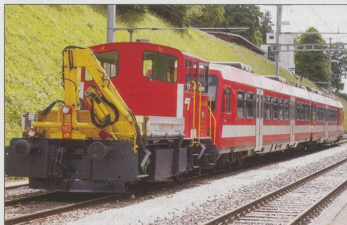
A helping hand from the CJ.

subsidies and revenues for the various operators providing services. He calls it, 'Compter les moutons' – 'Counting sheep'. It provides some interesting moments such as on 14th June at La Chaux de Fonds, when Chemins de fer du Jura (CJ) railcar No.560 141 arrived towing CJ diesel tractor No.232 182. Now the CJ runs into La Chaux de Fonds as it is the western terminus of its metre-gauge main line. However 560 141 ran in on the SBB's standard gauge line from the Sonceboz direction, the explanation being the SBB urgently needed a shunting tractor at Le Locle, and the CJ was able to help. But the CJ's standard gauge is far away, up at Porrentruy, on the Bonfol line, from where 560 141 that normally works its passenger service, had come from. Mario permitted himself the (purely rhetorical) question - why had the national network to be bailed out at such effort by a far off local line?