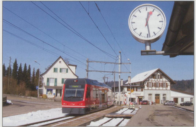
ASm service to St Urban Ziegelei at St Urban, March 2010.

works (Ziegelei), beyond there passenger trains have not run since 1982. There were one or two excursions, which frightened the chickens, and the overhead wire had to be turned on. Freight had also stopped, and so the concession, at the application of operator ASm, has been cancelled by the Federal Transport Department with the agreement of Cantons Bern and Luzern. As can be seen, closure alone is not the issue; it is a legal process directly relating to the terms on which the line was authorized, built and operated, which releases the applicant from all obligations. Most people in Melchnau won't notice any difference.