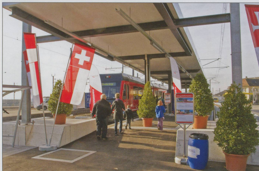
MIDDLE: Units 104 & 103 cross and reverse at Neiderbipp, March 2010. BOTTOM: A colourful display of flags at Oensingen for the reopening , Octobet 2012