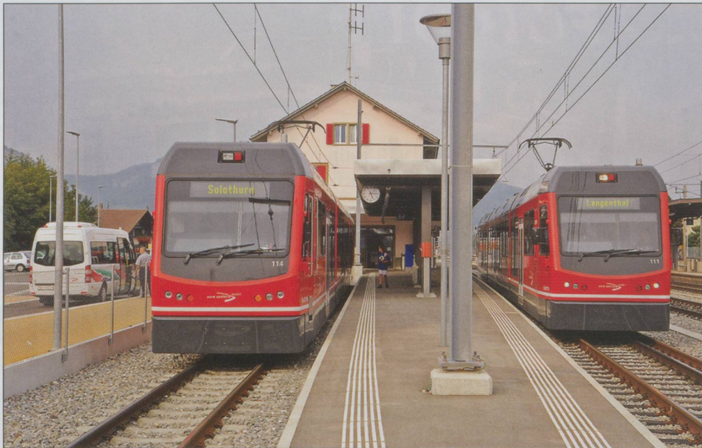
ABOVE: Asm Be 4/8 3-car units 114 'Saturn' & 111 'Jupiter' meet at Niederbipp working the R453 16:52 Langenthal-Solothurn and R454 16:48 Solothurn-Langenthal, respectively. On the left is the Bus 60 service that provided the link to Oensingen Bahnhof via Niederbipp Industrie.

renamed as the Regional Verkehr Oberaargau (RVO) later becoming the Oberaargau Solothurn Seeland Transport, when it merged with other transport operations in the area, then adopting the ASm name. Part of the group is the isolated