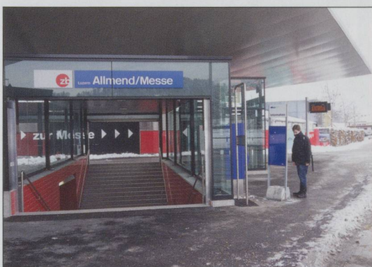
BELOW: ZB train calling at Allmend Messe.