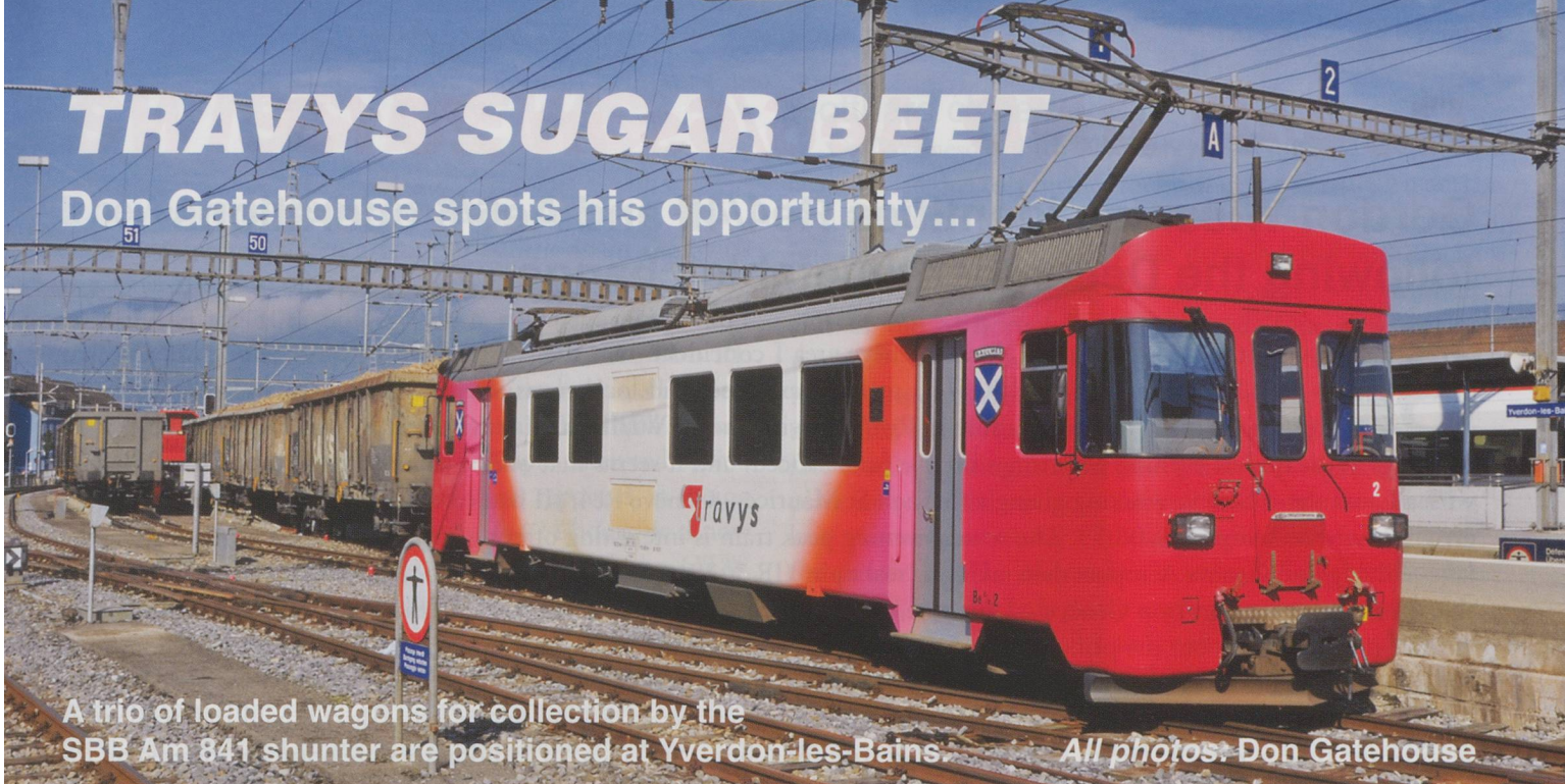
A trio of loaded wagons for collection by the SBB Am 841 shunter are positioned at Yverdon-les-Bains.