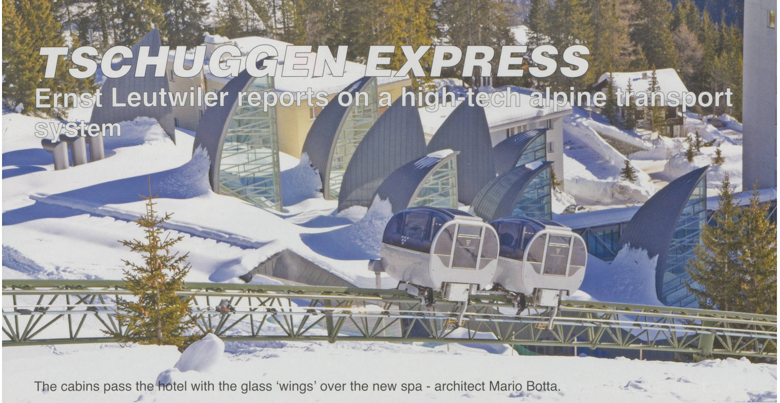
The cabins pass the hotel with the glass 'wings' over the new spa - architect Mario Botta.

Ernst Leutwiler reports on a high-tech alpine transport system