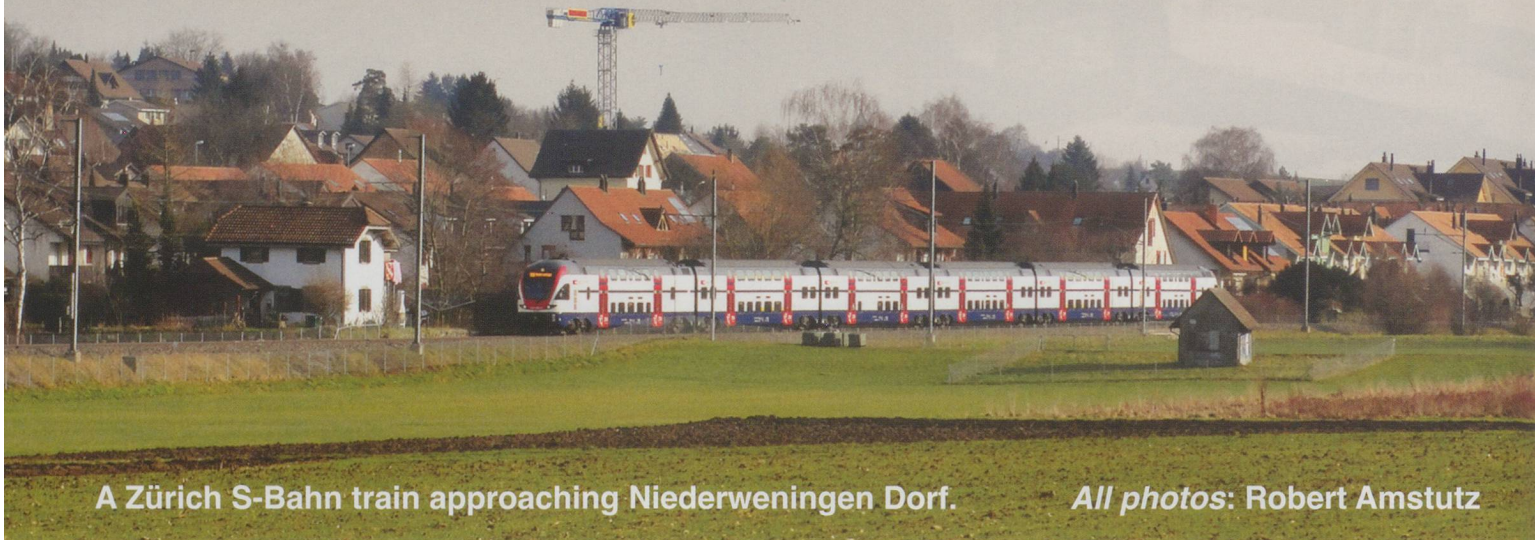
A Zürich S-Bahn train approaching Niederweningen Dorf.