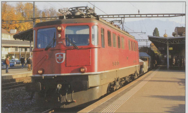
11430 rumbles through Vevey station with the afternoon St Maurice – Denges freight.