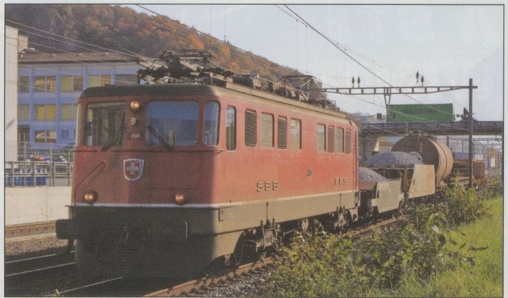
11430 passes Aigle with the afternoon St Maurice – Denges freight.