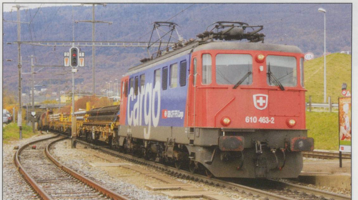
610 463 heads east through Marin Epagnier with the afternoon trip to the Vigier concrete sleeper works at Muntschemier.