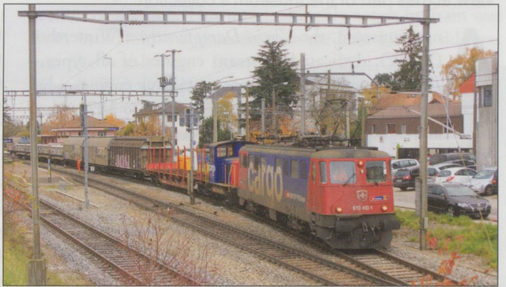
610 492 prepares to leave Marin-Epagnier with the afternoon trip freight back to Neuchatel yard.