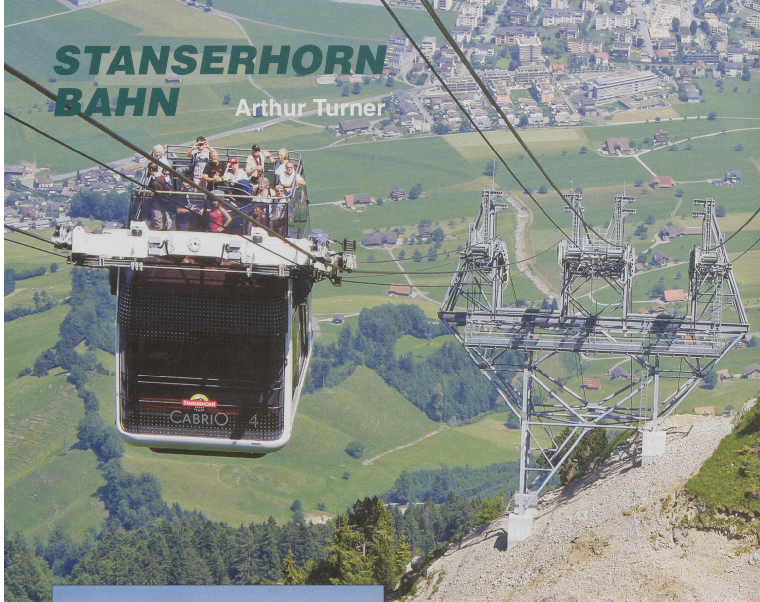
ABOVE: Seen from the upper deck of a parallel cable car, showing suspension from cables at its sides.