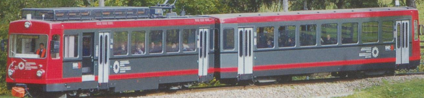
Ex. TB, BDe 4/8 No.21 is seen approaching Wolfsgraben Ritten.