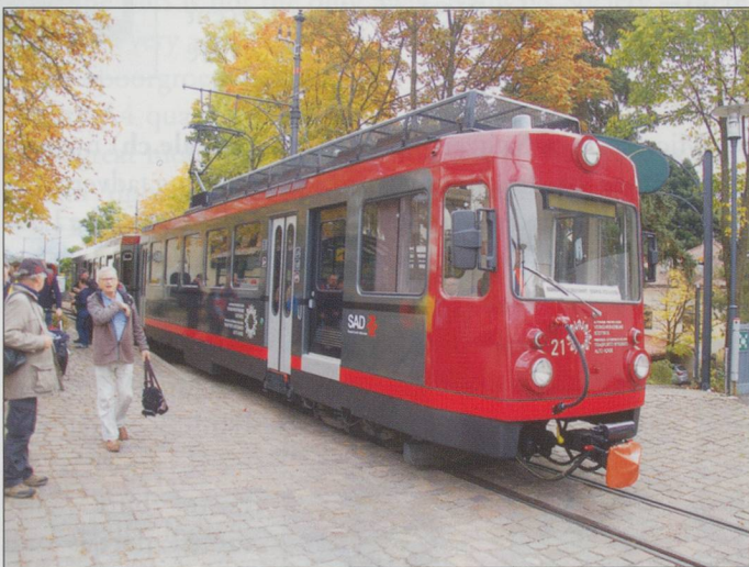
BELOW RIGHT: No21 approaching Wolfsgraben Ritten.