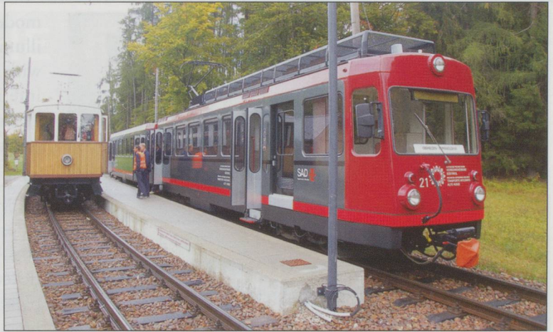
ABOVE: 'Oldtimer' No2 and No21 cross at Lichtenstern - Stella Ritten.