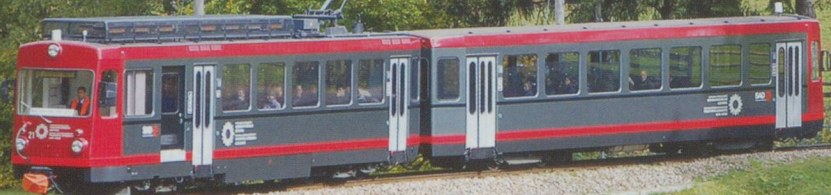
Ex. TB, BDe 4/8 No.21 is seen approaching Wolfsgraben Ritten.