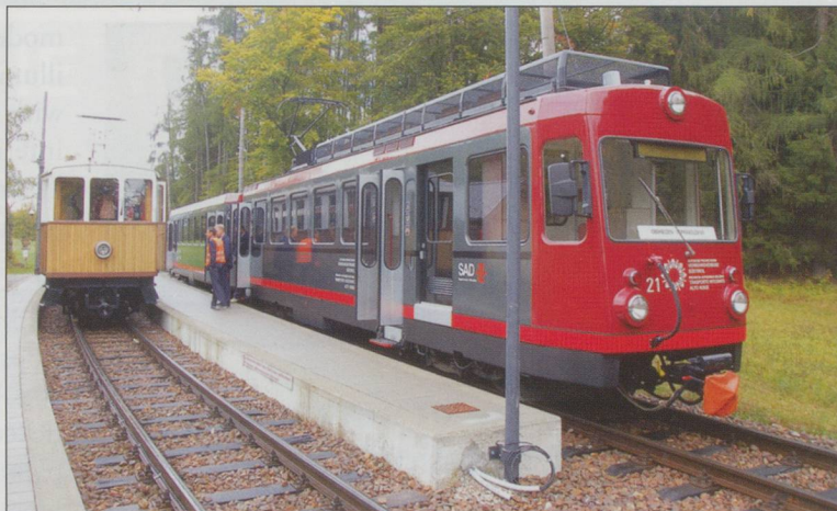
ABOVE: 'Oldtimer' No2 and No21 cross at Lichtenstern - Stella Ritten.