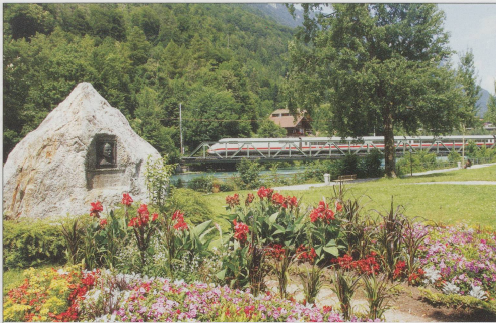
A DB ICE service crosses one of the bridges over the Aare canal, seen from the adjoining gardens.

on the Brienzersee. With hindsight that was a mistake, although understandable as the plans were to build a railway from Bönigen up to Lauterbrunnen. The Aare-canal access was however improved as far as the Zollbrücke (today's Interlaken Ost), enabling the steamers and the railway to Lauterbrunnen to start there. The Bönigen branch became an incubus, undermining the receipts, and Bönigen an idyllic corner, though the BLS still has a workshop there.