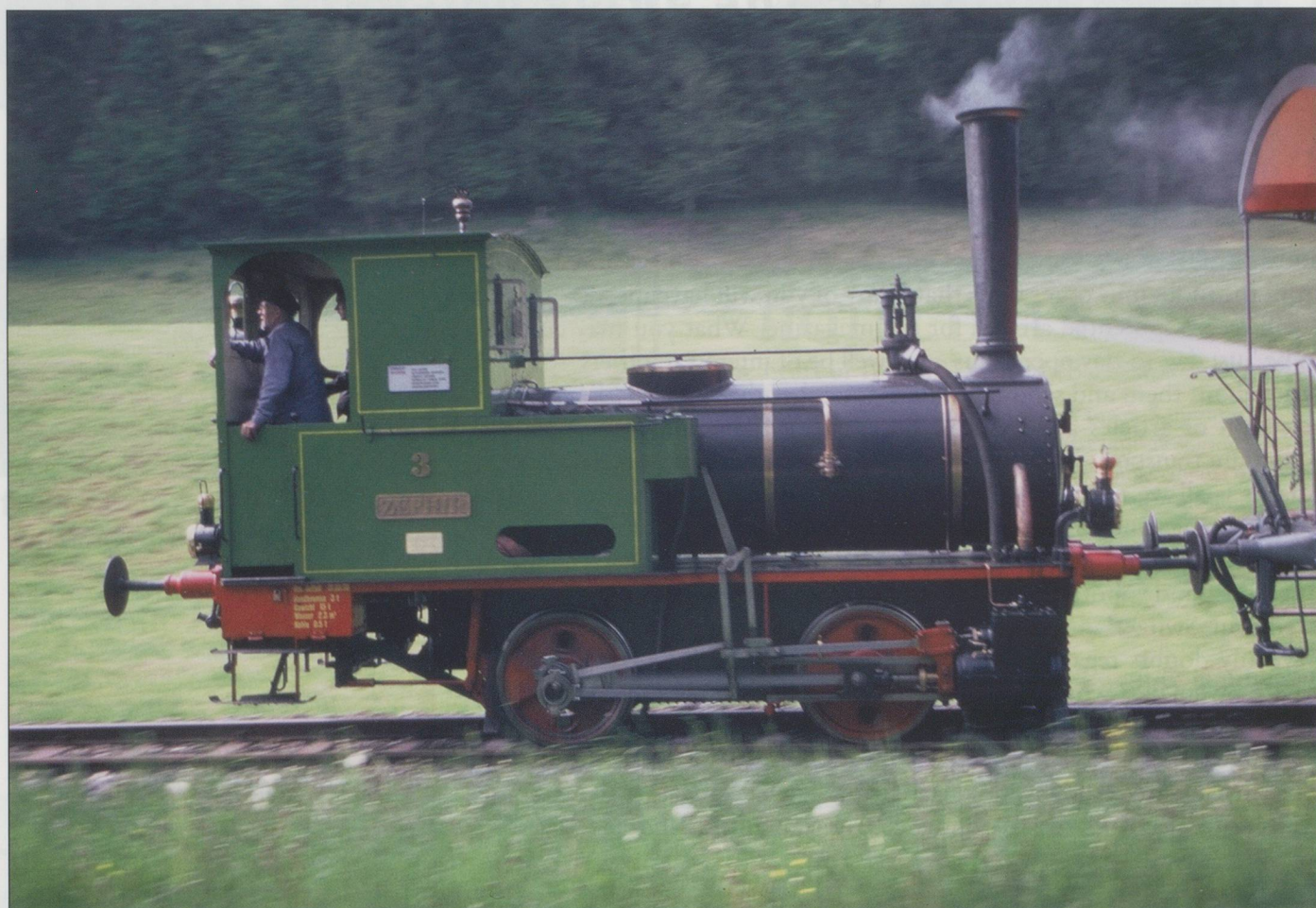
'Zephyr' at Wasen im Emmental in 1998.