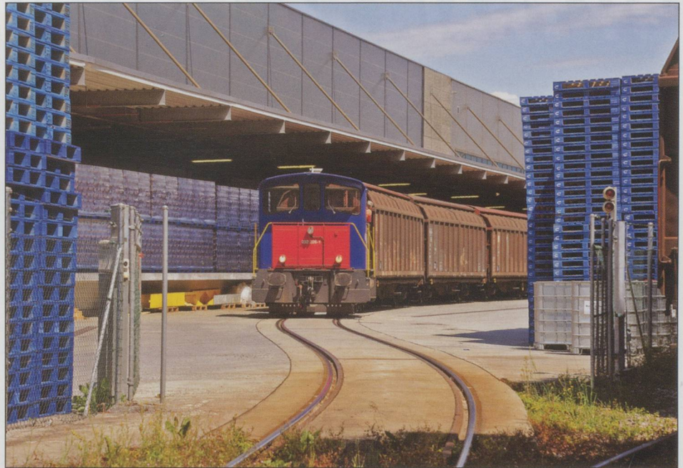
ABOVE: Having arrived with a train of empty vans, SBB Cargo Tm 232 226 was being coupled to the rake of loaded vans to be removed from the Rauch Trading AG premises at Widnau.

This lunchtime Red Bull departure from St Margrethen to Singen and beyond was recorded at Rorschach behind DB 185 094 in June 2012.