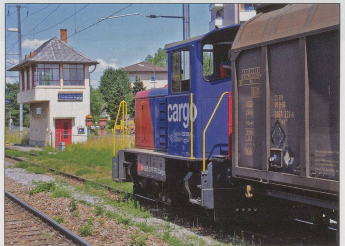
BELOW: The disused signal cabin at Heerbrugg marks the junction of the short freight only branch to Widnau. The mid-afternoon working of loaded vans waits for a path north to St Margrethen.