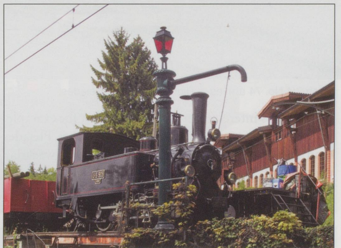
BELOW: Former Jura-Simplon G3/3 loco No. 909 replenishes its coal stocks at the bifurcation near Chaulin Museum.