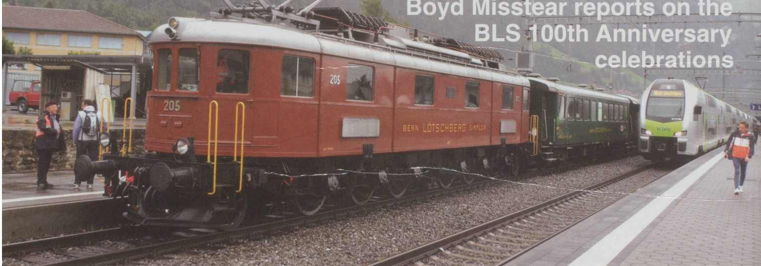
Ae 6/8 No 205 Swiss Class Train at Frutigen during the BLS100 Festival.

Boyd Misstear reports on the BLS 100th Anniversary celebrations