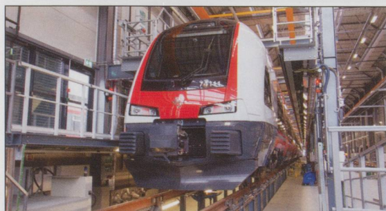
TOP: Stadler 74518 at Drammen in Norway