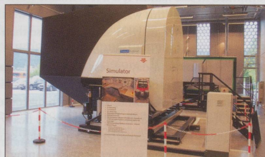
taken on 12th June 2012