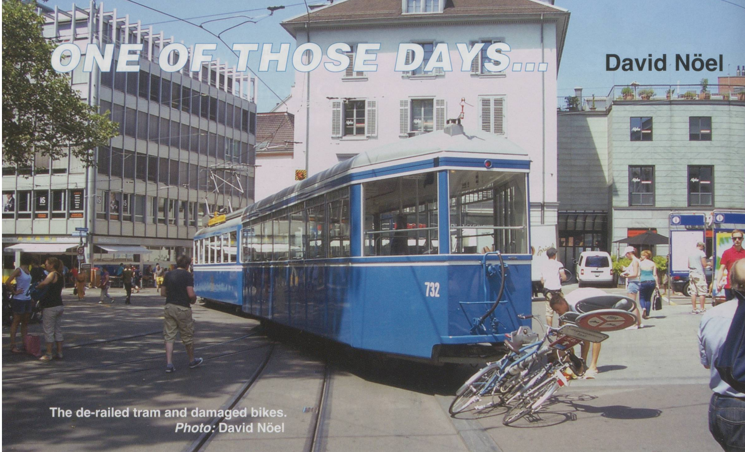
The de-railed tram and damaged bikes.