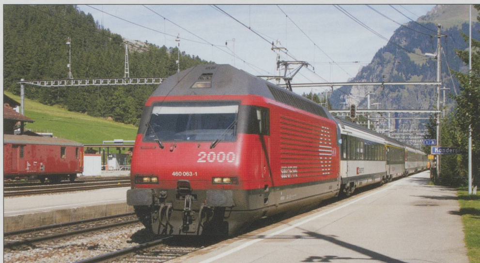
SBB 460 063 calls at Kandersteg on 28th September 2006, still with a loco hauled passenger train .