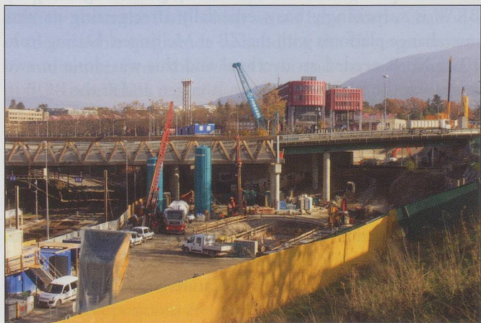
CEVA works at La Praille Yard.

Work is well under way on the re-electrification from the French 1500V dc to 25KV ac between Genève and La Plaine. The new overhead poles are seen here at Bourdigny in November 2012. The SNCF signalling is also being converted to the SBB standard. Freight trains between La Plaine and La Praille freight yard are being diesel hauled.