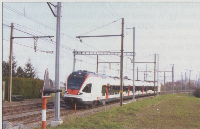
New masts at Bourdigny

Praille freight yard, preliminary tunnel mouth excavations and tram route track alterations at Bachet de Pesay, and removal of the late 19th century abutments at Eaux Vives dating from the abortive late 19th century plans for an equivalent of CEVA. Preparations are also under way along the track bed east from Eaux Vives station. From April buses have replaced trains to and from Annemasse.