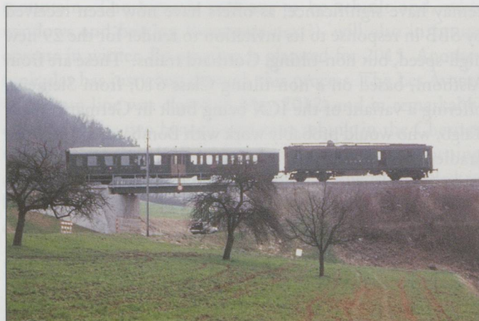
No. 1692 between Etzwilen and Singen in the 1960s.

museum railway - the SEHR, for the last 4-years. Like many enthusiast lines they may have taken-on more than they can cope with, with the result that a valuable artefact is rotting away.