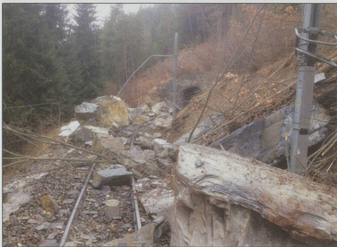
Chur - Arosa line blockage.

At 22.00 on Good Friday evening a rock fall blocked the Arosa line 1/2km above Lüen. The fall originated 500m above the railway line and it is estimated that upwards of 20,000 square metres of rock was deposited on the line. The major problem for the RhB's engineers was not just clearing up the line, and repairing catenary, signals, drains etc., but knowing what is still up there as the Tschanfigg valley is renowned for its geological instability. Services over the busy Easter period were seriously disrupted, but after this peak period the Arosa valley is 'dead' until summer, so replacement bus services were able to cope during the clearance and reconstruction period. The line re-opened on the 24th April.