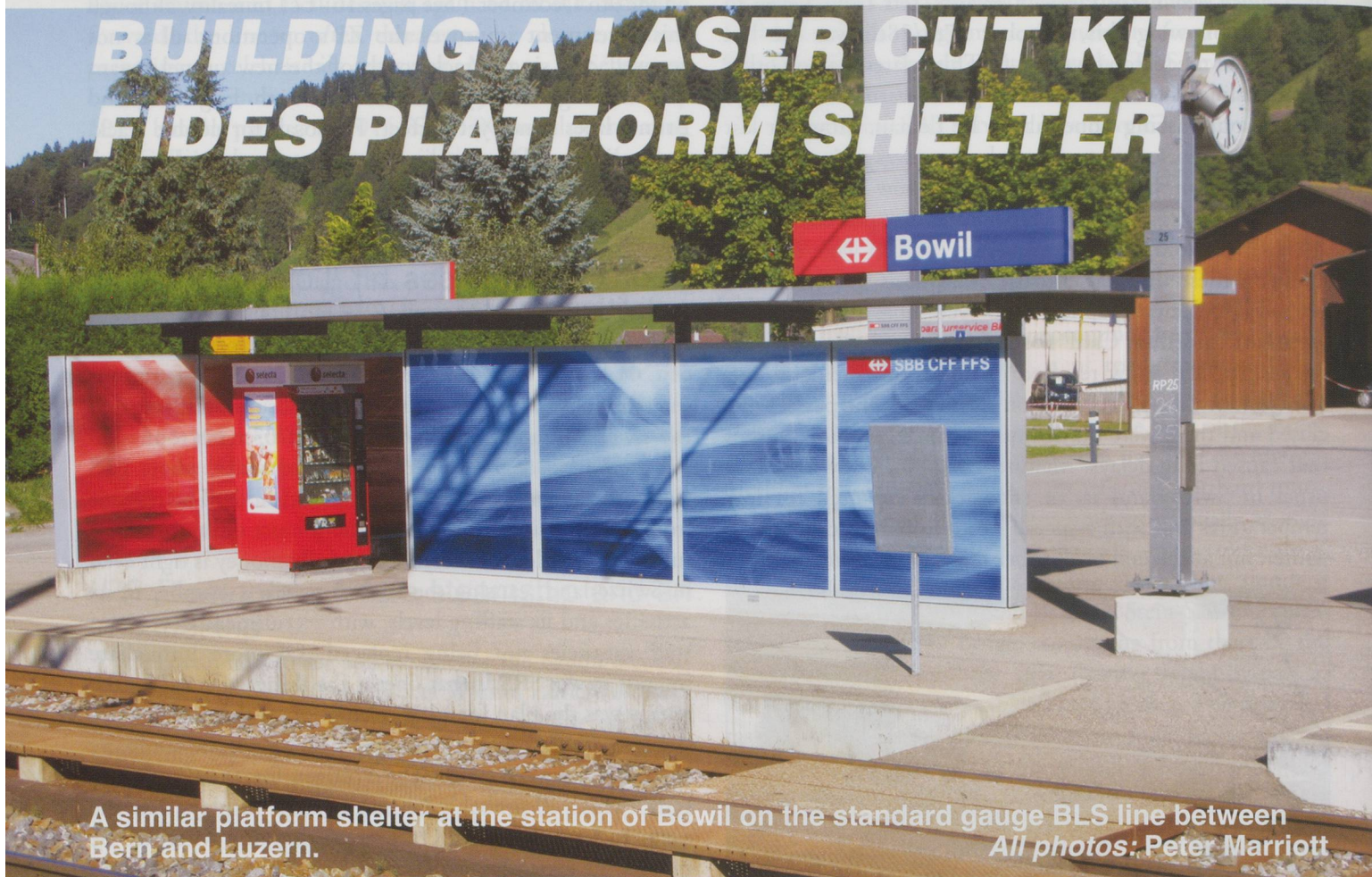
A similar platform shelter at the station of Bowil on the standard gauge BLS line between Bern and Luzern.