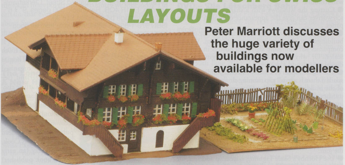
An Emmental farmhouse (a plastic kit by Kibri) with a handmade garden along side.

Peter Marriott discusses the huge variety of buildings now available for modellers