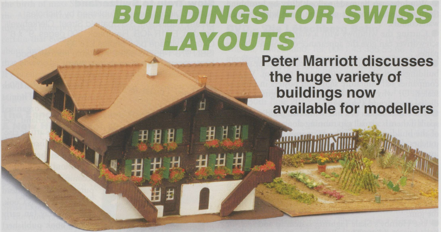
An Emmental farmhouse (a plastic kit by Kibri) with a handmade garden along side. All photos: Peter Marriott

Peter Marriott discusses the huge variety of buildings now available for modellers