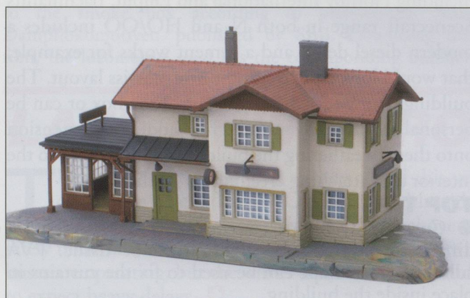
A Kibri plastic kit of the SBB Maienfeld station near Sargans awaiting its signage.