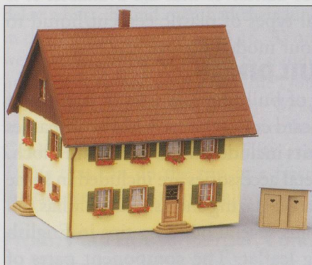
A laser-cut house and outside toilet from Noch. The addition of window boxes makes the house look "more Swiss".