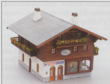
This Faller kit of a sports shop has been fitted with window display detail including a model modelling sportswear.