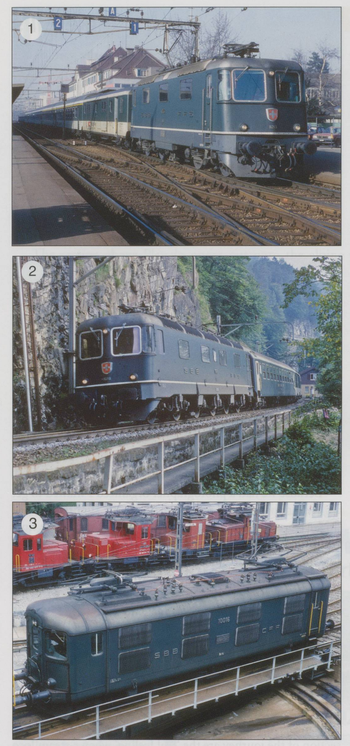
Re4/4II 11243 at Thun on a working to Interlaken on 28 January 1989. Re6/6 11688 Linthal approaching Brunnen on a Chiasso – Schafhausen working on 6 September 1989. At this point the southbound track is in tunnel while the northbound one uses the original single track. Re4/4I 10016 on the former turntable at Luzern shed. Note the 'blank'

bodyside on the non-corridor side of the locomotive.