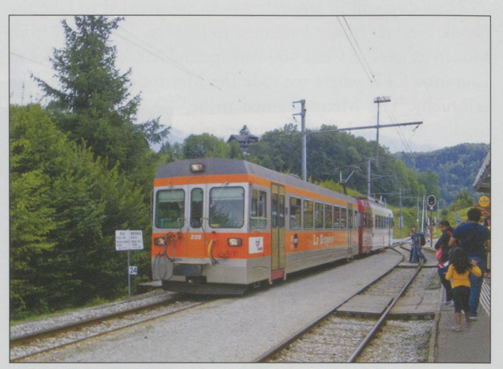
TPF No. 226 at Gruyères on 7.9.2013.