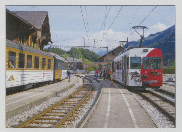
Changing trains at Montbovon on 7.9.2013.

before the Genève train. Seeing the Train Manager on the platform she greeted us with a broad smile saying "We have made the connection, so everyone is happy." She must have gone home that night pleased that she had made the right decision. A nice end to our stay in Montreux, our Swiss Passes yet again seeing much use and proving excellent value for money. After a week of good weather it was time to move on to Grindelwald where it rained, but that is another story.