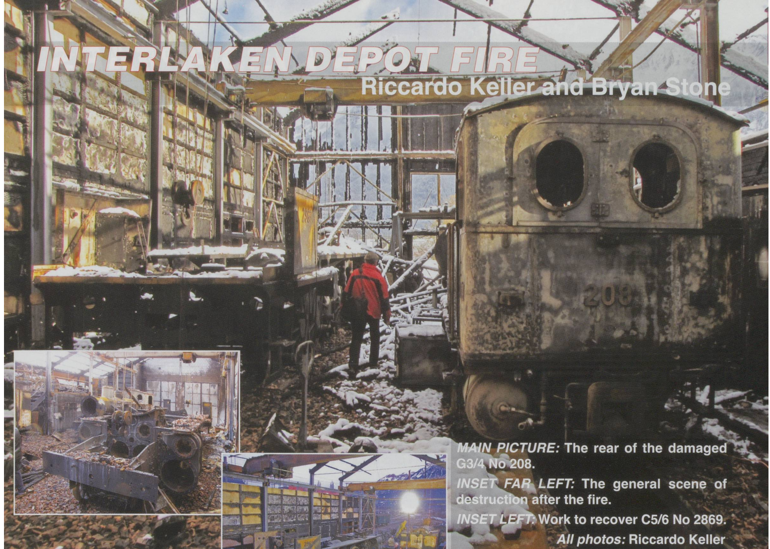
MAIN PICTURE: The rear of the damaged G3/4 No 208.