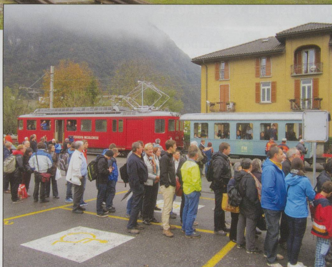
Crowds queue to ride the special services.

In the circumstances SEFT decided to extend the season with two more Sunday operations on the 20th and 27th October. On both days many visitors from all over Switzerland, and from Italy, went to Valle Mesolcina to say good-bye